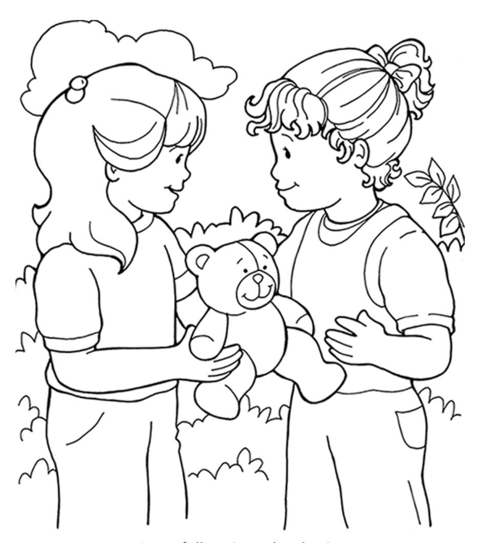
I can follow Jesus by sharing.

From Thru-the-Bible Coloring Pages © Standard Publishing. Used by permission. Coloring Books may be purchased from Standard Publishing, www.standardpub.com, 1-800-323-5473.