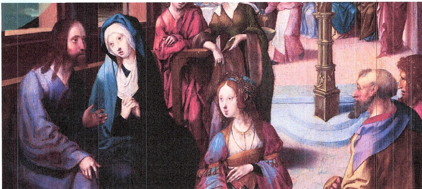
Christ's Second Visit to the House of Mary and Martha. Cornelis Engebrechtsz, Rijksmuseum

In today's Gospel, Jesus says to Martha, "Did I not tell you that if you believe you will see the glory of God?" Lent is a time for reflection and restoration. Reflect on what strengthens your faith and ways in which you can continue to build a strong foundation. How can you be more open to God's will in your life?