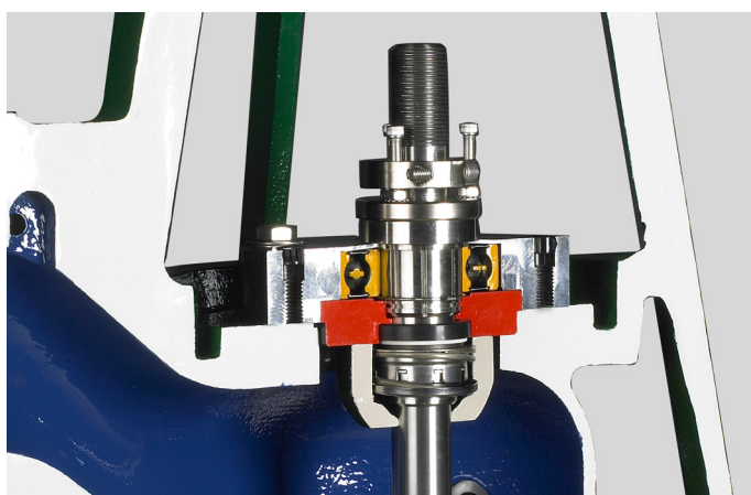
Cut-away of a Watertronics vertical turbine pump head featuring the mechanical seal