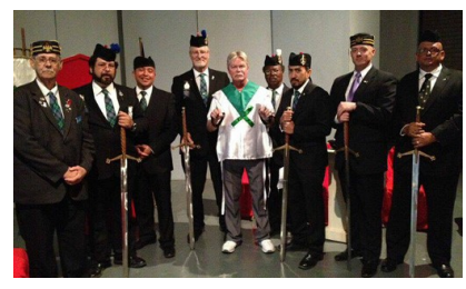
Our Knights of St. Andrew took a quick trip to Las Cruces to join their Spring Reunion and conferred the 29th degree.