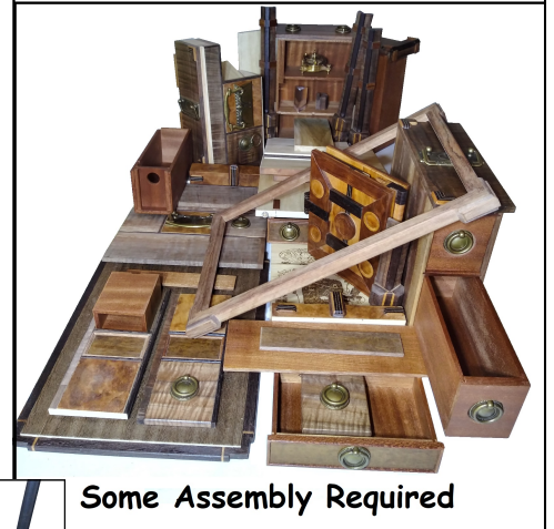
Some Assembly Required

I enjoy writing, and this project allowed opportunity to produce the short story that