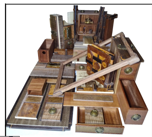
Some Assembly Required

I enjoy writing, and this project allowed opportunity to produce the short story that