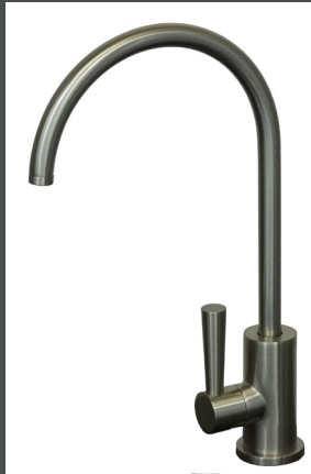
EF-97 Series Contemporary Euro style