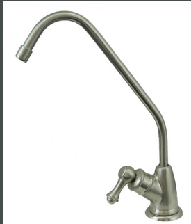
EF-9-AG Series ... Air-Gap

Compliant with California Proposition 65 and AB1953.