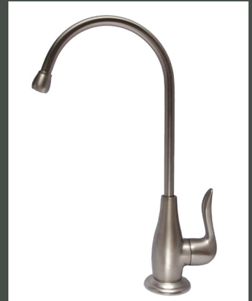
EF-32 Series Soft & Elegant; Vase-body style