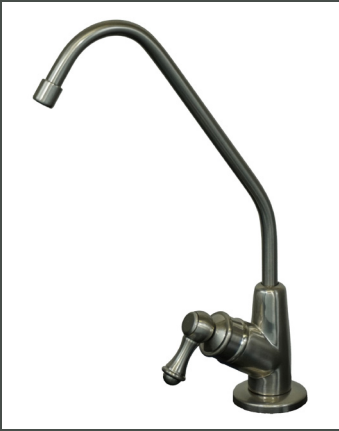
EF-9 Series Iconic style