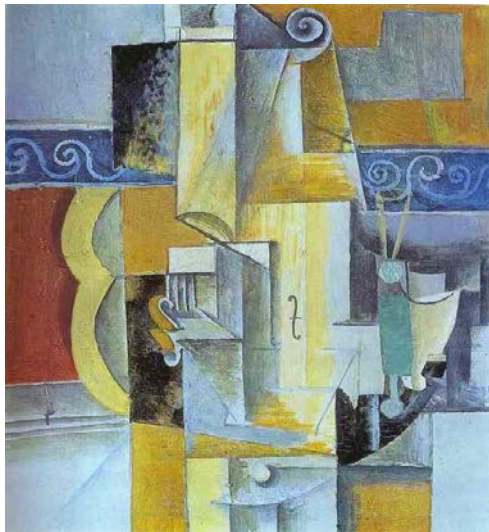
Violin and Guitar