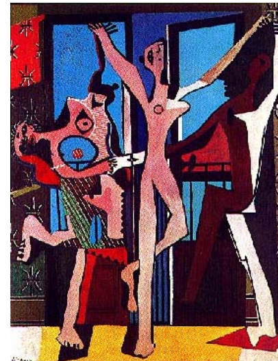
The Three Dancers