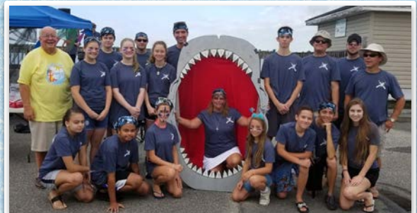
2017 Water Warriors Team

Please register at olssyouthgroup.com . If you can't paddle, your donations will help the team raise money for SMCR. Please see the main Parish website olss.org for info.