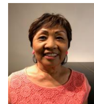
Co-Presidents: MTACLB Branch