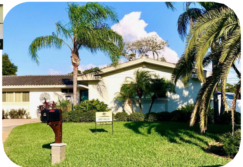
Keeping it beautiful on Beechdale Court