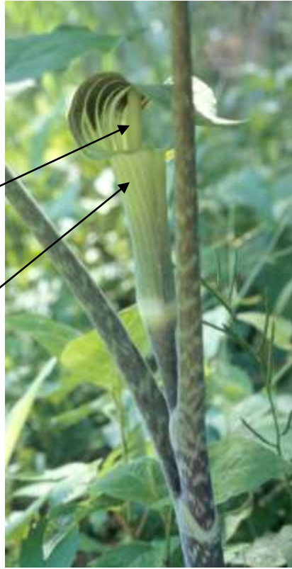
Jack In The Pulpit