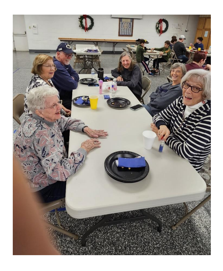
OUR FIRST ANNUAL NEW YEAR'S EVE AFTERNOON GAME NIGHT WAS WONDERFULLY ATTENDED!