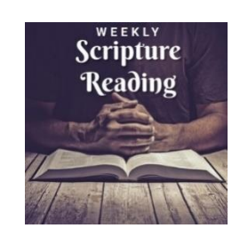
The Bible readings are from "Book of Common Worship"