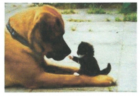
Okay, Ralph .... let me 'splain it you again. You're big, I'm little; BUT!!! you're dog, I'm cat ..... that makes me the boss. Got it ??

Line dancing was started by women waiting to use the bathroom.