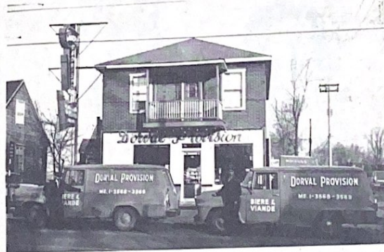
Since this picture was taken, a third truck has been added to give you better, and faster service

Quality Meats Choice Groceries Fresh Fruits and Vegetables COMPETENT PERSONNEL THREE TRUCKS PROVIDE FAST SERVICE