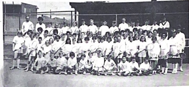
DORVAL TENNIS CLUB

Camping commences July 3rd to August 11th with the three 2 week periods being (1) July 3rd to July 14th, (2) July 17th to July 28th, (3) July 31st to August 11th. Fees