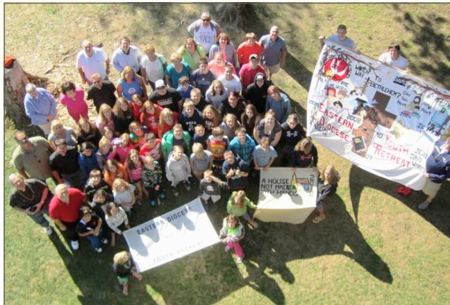
Youth Retreat 2012, titled "A House Not Made With Hands," where 94 youth, adults and clergy from 11 parishes across the Eastern Diocese gathered at Camp Howe in Goshen, Massachusetts

Sin, Confession, Examination of Conscience, Penance, and the Holy Eucharist