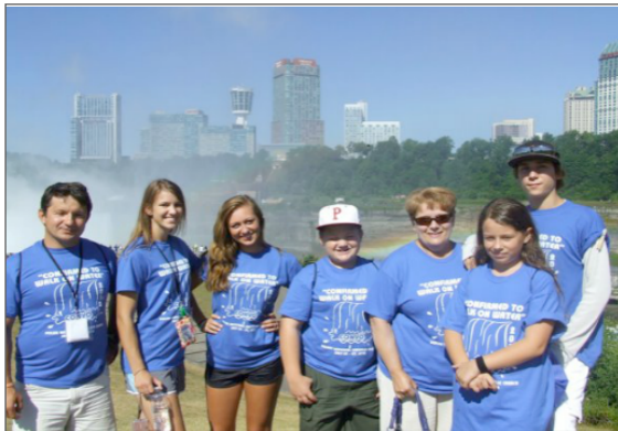
Convo 2012, which is titled "Confirmed to Walk on Water" at Niagara University

This year, our youth joined with others from the PNCC to attend National and Diocesan gatherings. Convo 2012, titled "Confirmed to Walk on Water," was held at Niagara University in late July. All youth of the parish ages twelve and up are eligible to attend Convo. Children eight years and older are eligible to the Annual Eastern Diocese Youth Retreat at Camp Howe in Goshen, MA in mid-August.