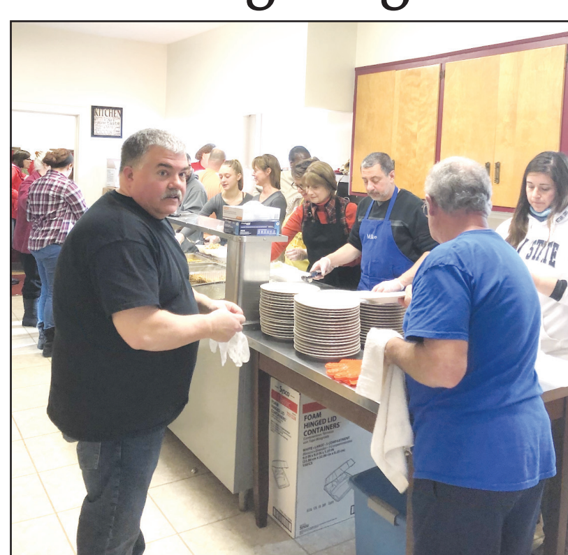
Volunteers at St. Stephen's Episcopal Church are busy preparing meals for delivery on Thanksgiving Day 2023.

She said the timing of her adding the duties as pastor at Bethany a few years ago was fortunate for the annual Thanksgiving dinner effort because it brought in new volunteers. She related that St.