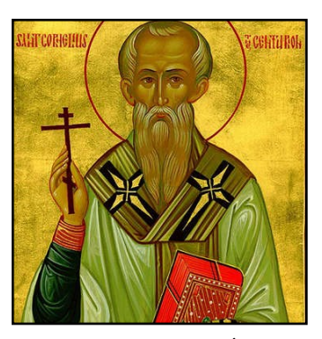
Feast Day: September 16

Isaiah 55:6-9 Philippians 1:20c-24, 27a Matthew 20:1-16a