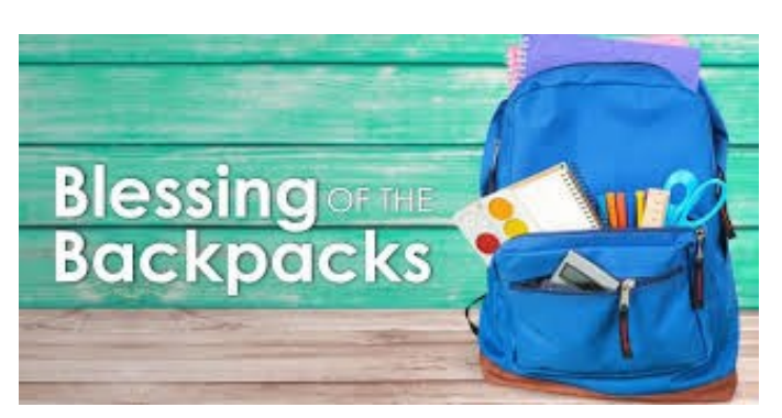
Weekend of September 20, 2020

MASS REGISTRATION Online https://signup.com/go/LNZufWb