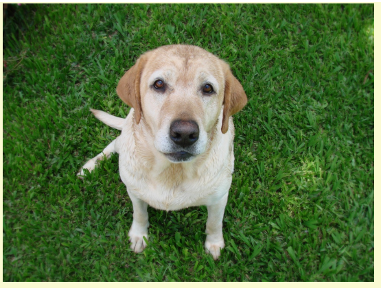
It's tough to imagine our dogs as anything other than loving, but to a pig, they can be deadly.