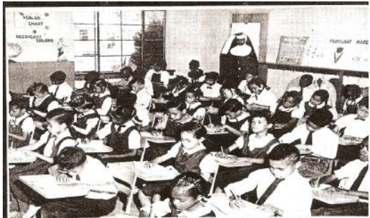
The 3rd & 4th graders are learning to write.