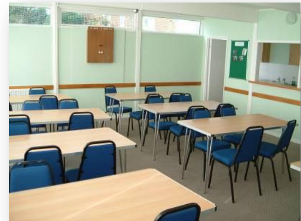
The Small Hall

This gives an annual income of approximately £36,000.