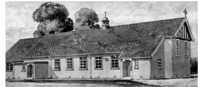
The first church building- destroyed by fire in 1941

Each week on Friday and Saturday, the school furniture was moved out of one of the huts and it was equipped for the Sunday Services, then on Sunday evening after the final service, the process was reversed and the building was prepared for the day school next morning. This arrangement continued until Easter 1951, when the new day school was completed and the church then took possession of the three huts on payment of a nominal sum of £100 to the Lancashire Education Authority.