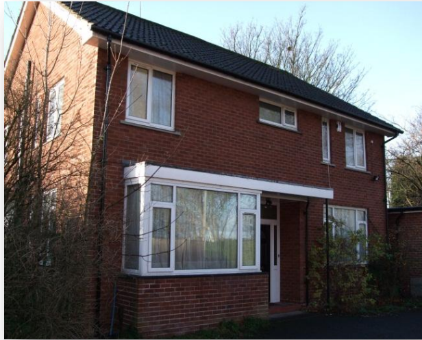
The front of the vicarage

The brick built vicarage dates from the 1960s and is a good sized, family, detached home, well-secluded behind the church with its own drive.