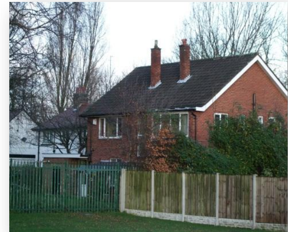
The rear of the vicarage

The Vicarage has recently had new outer doors fitted.