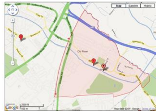
Location of the Parish of Aintree