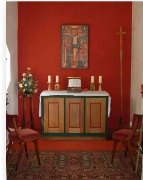
The S Peter Chapel

Our organ, built by Henry Willis & Sons Ltd. at their Liverpool Works. We have a regular Church Organist.