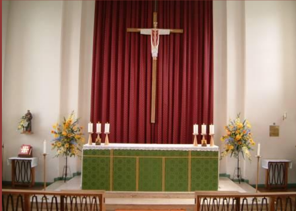
S Giles with S Peter, Aintree Lane, Aintree, Liverpool www.stgilesaintree.co.uk