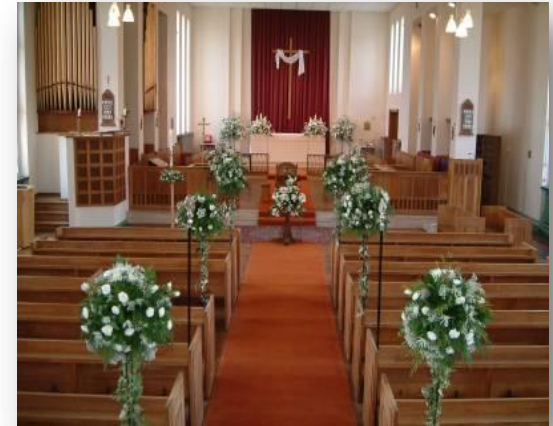
Flowers at Easter

Finally, we sponsor five children in different parts of the world through World Vision, a Christian Organisation.