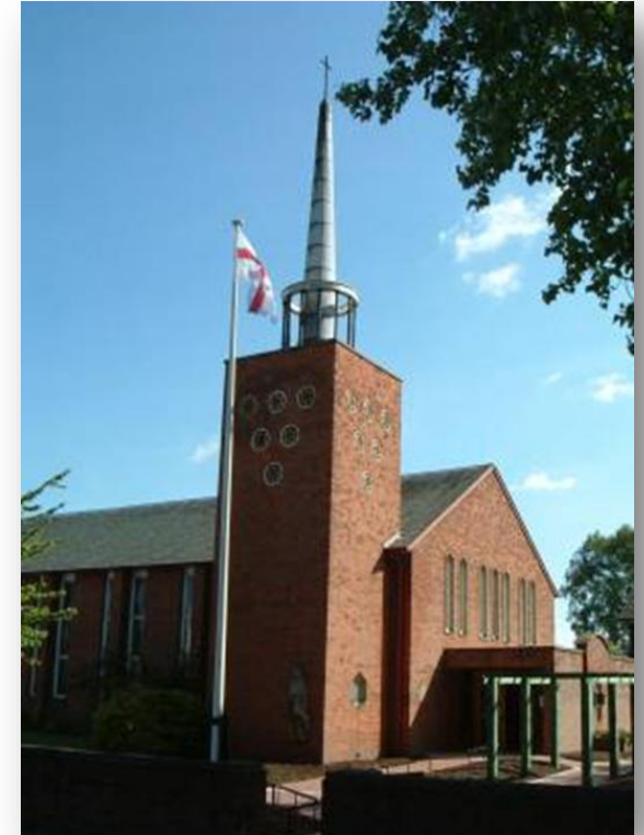
The parish church of S Giles with S Peter

The Church building also contains The Lady Chapel, a Godly Play Room, the Vestry, the S Peter chapel, a "kids' corner", an office and a disabled toilet.