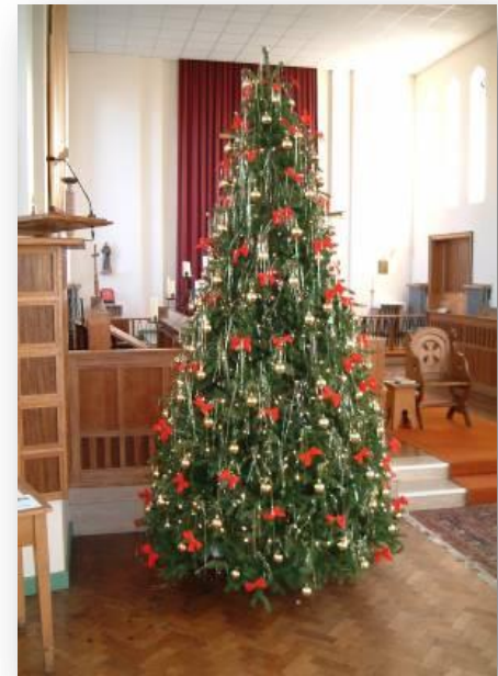
Our "lights of Love" tree

The 'Lights of Love' and trees are blessed and dedicated during our Carols by Candle Light Service on the Sunday prior to Christmas.