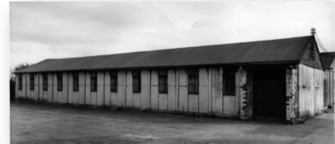
One of the huts

The last service to be held in this temporary church was Evensong on Passion Sunday, 18 March, 1956. For many this was a somewhat sad occasion, for the family of S Giles had become attached to the 'Little Church' because the smallness of the building had created a friendly and homely atmosphere.