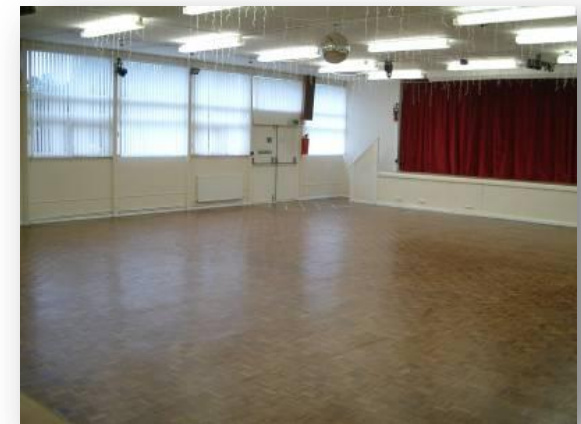
The Main Hall

A licensed bar is available in both venues and all drinks are sold at club prices.