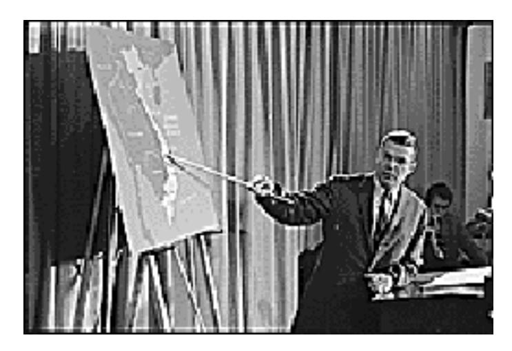
Secretary of Defense Robert S. McNamara's February 1965 press conference at the Pentagon. (Photo taken February 7, 1965.)