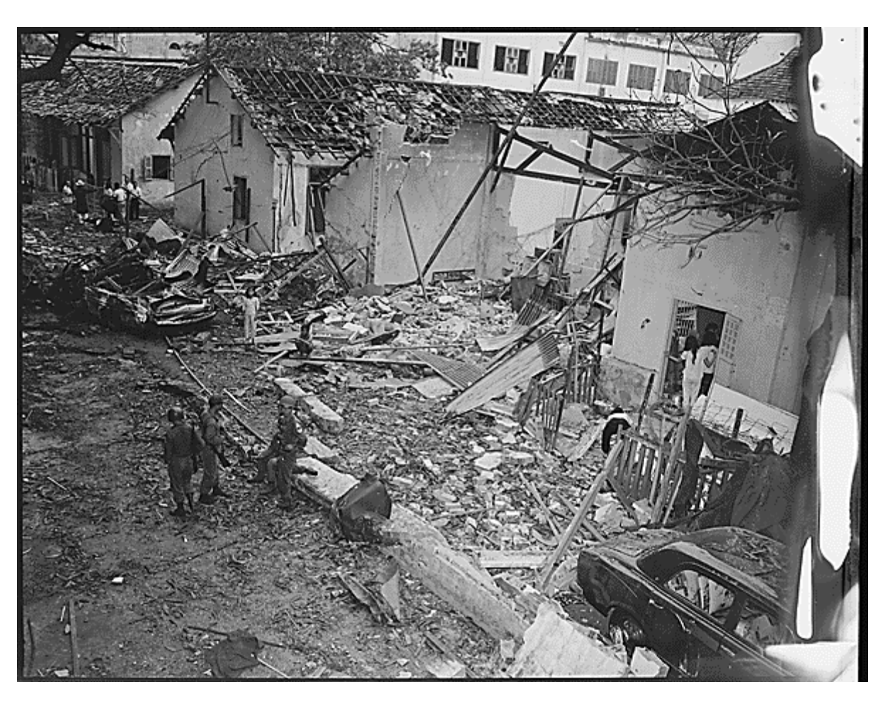
The Brink Hotel following the Vietcong bombing on December 24, 1964. Two American officers were killed.