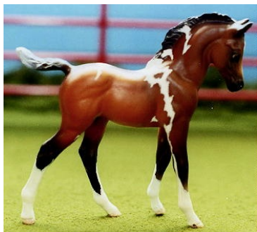
RESERVE CHAMPION CUSTOM WITH FACTORY PAINT: FAIRUZA (AP)

Repaint: Traditional or Larger (34): 1- Brimstone (JC), 2-Marshall Mellow (SC), 3-Breezen (AI), 4-Sparkling Chablis Z (CM), 5-November Rain (BR), 6-Fierra (LoB), 7-Limestones Far Lap (MR), 8-