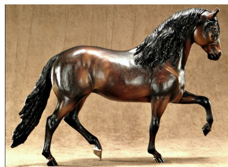
RESERVE CHAMPION SPANISH: MARQUESA (CM)

American Saddlebred (23): 1-20th Century Fox (VM), 2-Capital Genius (HC), 3-Sultan of Swing (JC), 4-EG Cool as Ice (MH), 5-TS Missy Brown (MP), 6-WBP Sweet Expectations (LeB), 7-Highland's Captain Jack (NF), 8-Divine Miss M (CR), 9-Kentucky Belle (CR), 10-Limestones Trooper (MR), HMs-Limestones Alberta (MR), Fall Sunrise (LeB)