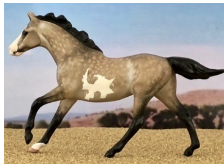
RESERVE CHAMPION REPAINT: BLACKBERRY LANE NOTORIOUS (SR)

Repaint w/Hair M/T: Trad. or Larger (38): 1-PR Eldorado Spanish Rose (JV), 2-Golden Malicious (SM), 3-PR Nazeem Al-Ashab (JV), 4-Rusty Iron Bars (AI), 5- WV Absolute Chaos (LeB), 6-Impressive Lady (CS), 7-TS Autumn Dancer (MP), 8-Rio Grande (CS), 9-Dakota Rose (JV), 10-DA Ben Macdui (JV), HMs-GS Soli- tude (MH), Poco Reina (NF)