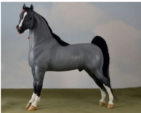
RESERVE CHAMPION GAITED BREED: STONOR EAGLE (EH)

Clydesdale/Shire (10): 1-Foxcroft Lad (LK), 2-Lady Of Trieste (CM), 3-Royal Scam (LK), 4-Royal Witch (AP), 5-Diamond Blue Rose (CR), 6-Northrigg Sable (VM), 7-Mae West (MH), 8-Barron's Burdon Belle (JV), 9-Castlekeep Mistress (LoB), 10-Dappled Doll (JH)