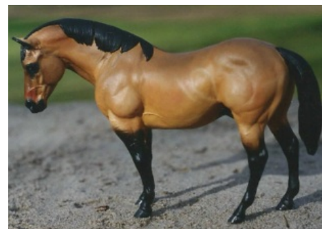
RESERVE CHAMPION STOCK BREED: CHINOOK'S HEZ IMPRESSIVE (VM)

Arabian (49): 1-Gossamer Wings (KW), 2-Warlord (NF), 3-Phoenix Rising (CR), 4-Talalik (MH), 5-RAS Khatifa (CM), 6-Halla Inca Gold (SH), 7-Tech Noir II (AI), 8-TC (CM), 9-Maamoon Azeem (SH), 10-KAS Dream Dancer (BH), HMs-Vijelie Noptii (BR), Heaven's Angel (SH)