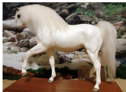
RES. CHAMPION SPANISH BREED: SD CONVERSANO DIAMOND (AP)

American Saddlebred (2): 1-Carnival King (LoB), 2-Cindy Lou Who (AP)