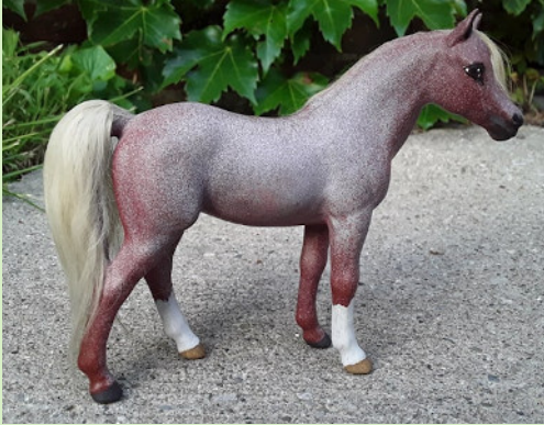
Strawberry Wine 50 Years Old!