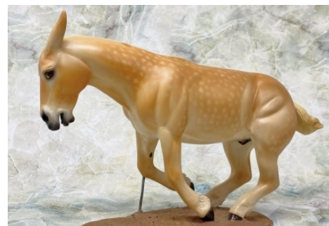
CHAMPION LONGEAR/EXOTIC/FANTASY: QUIT MENACING ME (SC)

Fantasy Equine (3): 1-TS Ramoth of Riell (MP), 2-Prince Harry (HC), 3-TS Trueheart (CS)