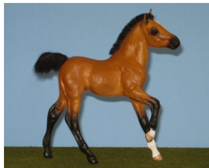
RESERVE CHAMPION CREAM/DUN COLOR: PREMIO (NF)

Blanket Appaloosa (47): 1-Mighty Bright J (AI), 2-J's Enchanted Ecco (AI), 3-DQ Storm Warning (SS), 4-The Paisley Palette (SR), 5-Murphy's Law (AP), 6-DQ Ima Sun Catcher (SS), 7-Lady