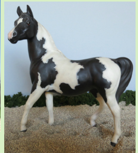
Solar Queen 45 Years Old!