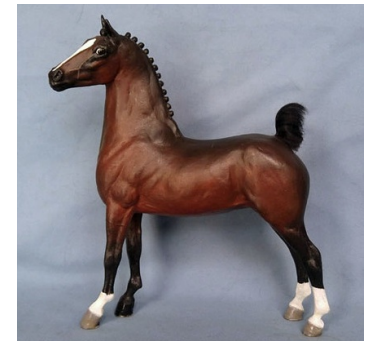
RES. CHAMPION MAJOR REMAKE/ REPAINT/HAIR OR SCULPTED MANE/ TAIL: SO CAPTIVATED (KW)

Extreme Remake & Repaint with Hair Mane/Tail: Trad. or Larger (69): 1-Matt Houston (JC), 2-Rastaman (BP), 3-Foxcroft Lad (LK), 4-Sylver Crescent (CM), 5-White Treason (MW), 6-Apollo (SH), 7-Tonto Bars Hank (VM), 8-Findelyn Berriydd (CM), 9-Wings of Desire (KO), 10-Stonor Eagle (EH), HMs-Legaciam (IC), *Opium III (MW)