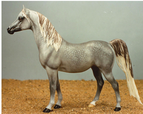
Mares (6): 1-Princesse Silver (KO), 2-Lady Glade (IC), 3-Sherwood Peacock (CM), 4-Lonesome Dove (CM), 5-DQ Shiaway Jetta (CM), 6-The Iron Madam (IC)