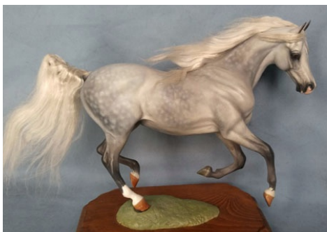
CHAMPION LIGHT BREED: GOS-SAMER WINGS (KW)

Other Pure or Mixed Light Breed (9): 1-Cassata (MH), 2-LJ Hit It Hal (SM), 3-Limestones Elemental Spirit (MR), 4-Red Hawk (SS), 5-TS Desert American Queen (MP), 6-Carolina Girl (SS), 7-Dream Theater (SR), 8-PR Malika Siglavia (JV), 9-WBP Abrianna (LeB)