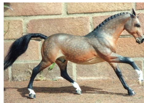
RESERVE CHAMPION SPORT BREED: APOLLO (SH)

Paso Fino/Peruvian Paso (7): 1-Danzante (AI), 2-Diamond Majestad (CM), 3-Encantador (CM), 4-ME Bolido (MH), 5-Trueno Azul (CM), 6-Stephano (MH), 7-Cancion De Amor (AP)