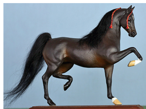
RES. CHAMPION PONY/MINI HORSE: WILD ART (KO)

Longear (10): 1-Quit Menacing Me (SC), 2-Double Dare (MH), 3-Shamrock Elfin Magic (SS), 4-Slightly Scarlett (HC), 5-Bilt to Boogie (SC), 6-DA Bardigano Honest John (JV), 7-Alter Ego (SR), 8-Whiskey Sour (CS), 9-Take My Picture (IC), 10-CZ Ambrose (JC)