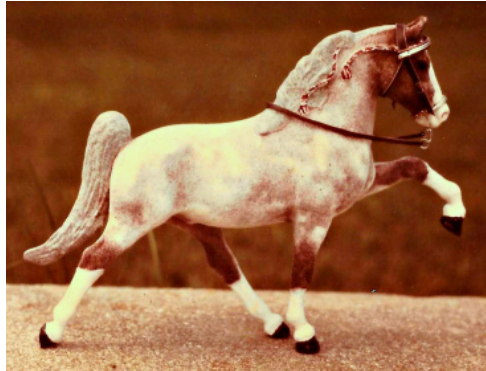
Gone But Not Forgotten: Vintage customs that no longer exist

Gaited Breed (1): 1-Roaring Roan (CM) [pictured at top of next column]