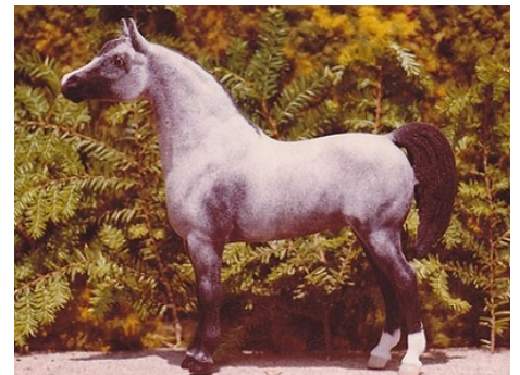
RES. CHAMPION FLOCKED/OTHER CUSTOM: BANSHEE (LD)

1960s/1970s WORKMANSHIP DIV. OVERALL CHAMPION: BIRCHWOOD GEISHA BOY (BP)