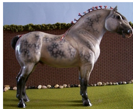
RESERVE CHAMPION DRAFT BREED: LEGACIAM (IC)

American Pony (20): 1-The Paisley Palette (SR), 2-Poco Suave' (HC), 3-DQ Butterscotch Brandy (AP), 4-Confederate Gray (LB), 5-Marshall Cody (LB), 6-Quicksilver (JC), 7-BBG's Silver Ghost (CM), 8-TS Sheldon (MP), 9-DQ Starsparkle (AP), 10-Lambchop (LD), HMs-Juliette (HC), Zip's Diamond Jim (CM)