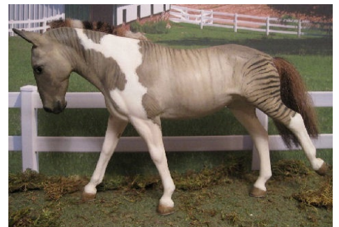
CHAMPION OTHER COLOR: ZAMBONI (HC)

Fantasy Color (3): 1-TS Ramoth Of Riell (MP), 2-Prince Harry (HC), 3-TS Trueheart (HC)