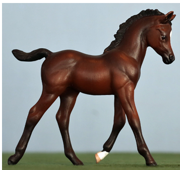
CHAMPION FLOCKED/OTHER CUSTOM: KHEHANA (KO)

(IC), 4-Verano Sombra (SS), 5-Carosel (HC), 6-*Ardiente (CH)