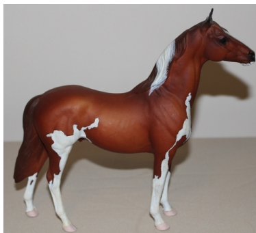
RES. CHAMPION CUSTOM W/FACTORY PAINT: MONARCHOS (LoB)

Repaint: Trad. or Larger (42): 1-Arahael (LoB), 2-Loftus Jones (LoB), 3-Azi (AP), 4-Wild Eagle (LoB), 5-Love Letters (LoB), 6-Heartbreaker (CH), 7-Prince Of Denmark (SS), 8-Montana Cat (LB), 9-Little Smoky (CF), 10-Rhapsody Redford (LB), HMs-Jazz (LK), Oak's Dun Purrfect (CM)