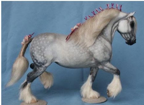
ZI Dragon (AI)