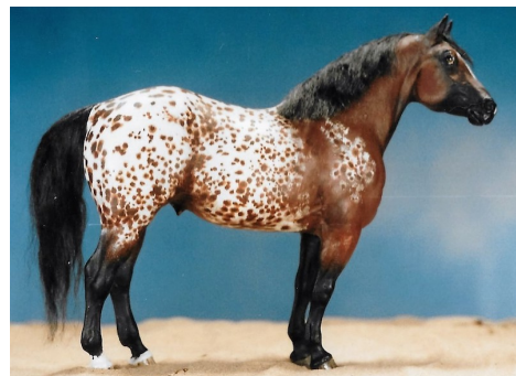
RES. CHAMPION MAJOR REMAKE/REPAINT/HAIR OR SCULPTED M/T: ROCKING CHAIR RENEGADE REVEL (CM)

Extreme Remake & Repaint w/Hair M/T: Trad. or Larger (12): 1-Birchwood Geisha Boy (BP), 2-Shales Commander (IC), 3-Diamond Handsome Devil (BH), 4-Rockledge Diamond Lark (CM), 5-SD Conversano Diamond (AP), 6-Diamond Fancy Cat (CM), 7-RM Bay Bandit (AP), 8-Brookridge Diamond II (AP), 9-Khedija (SS), 10-Merry Mountain Mist (AP),