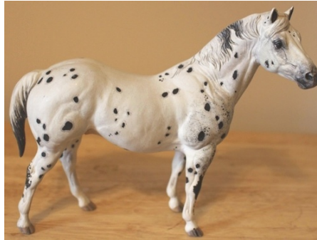
RESERVE CHAMPION REPAINT: BROTHER LOVE (LoB)

Repaint w/Hair M/T: Trad. or Larger (11): 1-Dane Tyler Bennington (LoB), 2-Paisano (NF), 3-Lakota Diamond (EH), 4-Minstrel's Joy (AP), 5-Ibn Samekh (AP), 6-KS Jersey Girl (BP), 7-Malika (SS), 8-Maharajah (LD), 9-Bint Kareyma (SS), 10-Faleen (SS), HM-Joker's Bear Trax (CM)