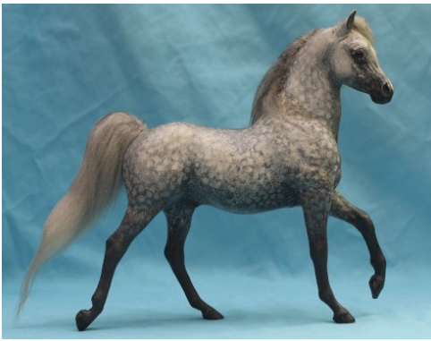
Leg 2: 1960s/'70s Overall Champion Breed