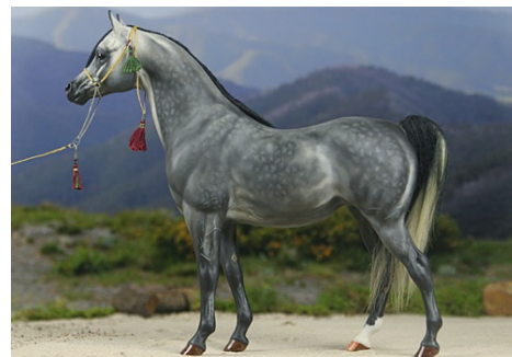
RESERVE CHAMPION LIGHT BREED: MON'NAFA RANI (CR)

Thoroughbred (32): 1-Matt Houston (JC), 2-Spider Ice (SR), 3-Heyday (KO), 4-Foolish Pleasure (JC), 5-Classic Girl (LD), 6-Purity (KO), 7-Winterfell (KW), 8-Royal Red (LoB), 9-Flying Tiger (KO), 10-Jetan's Glory (KO), HMs-Lights Out (JC), Ocean Rain (KO)