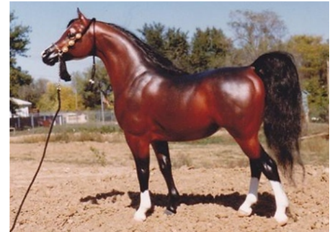
CHAMPION MAJOR REMAKE/REPAINT/HAIR OR SCULPTED MANE/ TAIL: SWEET JANE (LD)

Major Remake & Repaint with Non-Hair Mane/Tail: Smaller than Classic (4): 1-Bronze Idol (SS), 2-Imagine That (SR), 3-Midnight Monarch (CR), 4-Shez Candu (HC)