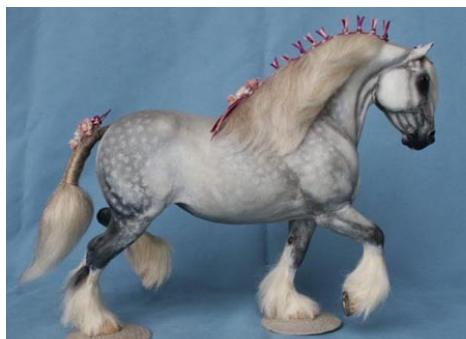
CHAMPION DRAFT BREED: RM NUCLEAR WINTER (KW)