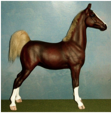
Classic Girl (LD), 10-Manchester Memory (MH), HMs-Legaciam (IC), Evenstar (SR)

Other Greys (37): 1-Tasha (KO), 2-Ha-sufel (KW), 3-Blessed Wine (BR), 4-Ap-palachian Spring (EH), 5-Mariah's Mou-barakeh (BH), 6-Serenity Syn Silver (CM), 7-Splashdragon (JP), 8-Winterfell (KW), 9-Blank Stare (SR), 10-Azi (AP), HMs-Clouds Over Vermont (CR), Haunt-ing Fox (JP)