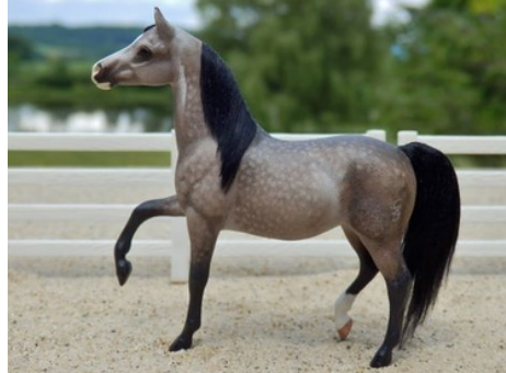
RES. CHAMPION SIMPLE REMAKE/ REPAINT/HAIR OR SCULPTED MANE/ TAIL: BLESSED WINE (BR)

Major Remake & Repaint w/Hair M/T: Trad. or Larger (64): 1-Sweet Jane (LD), 2-Jamil Mhuratt (CR), 3-Dakota Shyster (LoB), 4-Spider Ice (SR), 5-SKS Aristo Khat (CM), 6-Lady Love (LoB), 7-Hollywood Starlette (CM), 8-Bonnie Blue Butler (IC), 9-Indiana Lawman (LoB), 10-ME Bolido (MH), HMs-KT Continental Rose (CM), Call To Glory (MH)