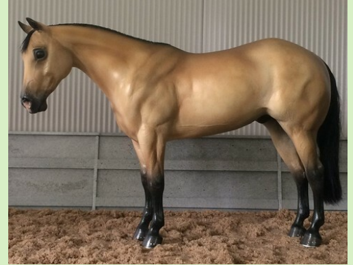
Jemez Antigua 30 Years Old!

(Have one created in 1963, 1968, 1973, 1978, 1983, 1988, 1993, or 1998? Get it into the Birthday Barn spotlight by e-mailing its photo and info to our Gmail address below!)