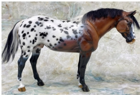
CHAMPION STOCK BREED: NANTY NARKING (SC)

Other Pure/Mixed Stock Breed (7): 1-Moonlight Drive (LK), 2-DQ Storm Warning (SS), 3-D.O. Rendezvous (MH), 4-Montana Cat (LoB), 5-The Cimarron Kid (JV), 6-Nabinabah The Bruce (CM), 7-MJW Golden Nugget (ShR)