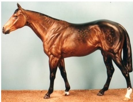
CHAMPION REPAINT: BRIMSTONE (JC)

Repaint: Smaller than Classic (50): 1- Blackberry Lane Notorious (SR), 2-En- caje (SS), 3-Chantilly Lace (BR), 4-Moor- land Monarch (BR), 5-Hoop De Do (IC), 6-Blackberry Lane Sunlight Revel (SR), 7-Emily (KO), 8-Drambuie (BR), 9-Fair Isle (LK), 10-Blue Out My Flip Flop (IC), HMs-Maximum Domination (IC), Lime- stones Wisp of Silver (MR)