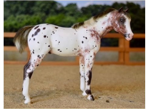
RESERVE CHAMPION PATTERNED COLOR: LUNA HALO (AI)

Longear/Exotic (22): 1-Zamboni (HC), 2-Out Of Africa (JC), 3-Zambezi (KW), 4-Double Dare (MH), 5-Pegi Soo (CS), 6-Tattor Tot (SC), 7-Get Your Groove On (JC), 8-DA Bardigano Honest John (JV), 9-Slightly Scarlett (HC), 10-Bilt to Boogie (SC), HMs-Shamrock Elfin Magic (SS), Chloe (CS)