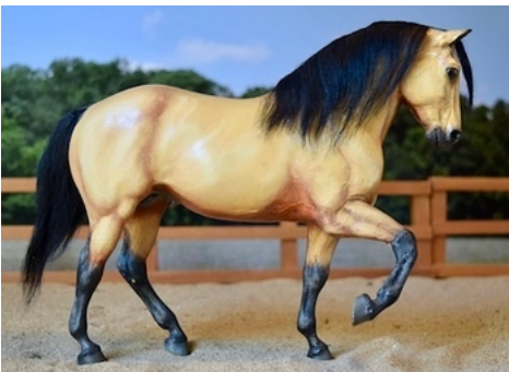
RESERVE CHAMPION SPANISH BREED: DANZANTE (AI)

ASB (17): 1-Dark Commander (CH), 2-Black Tie Affair (SS), 3-Call to Glory (MH), 4-Crimson Queen (SR), 5-DQ's Razzle Dazzle (IC), 6-Diamond Sungold (AP), 7-Personal Effects (LD), 8-Manchester Memory (MH), 9-Prince of Denmark (SS), 10-DQ Spicy Stepper (SS), HMs-Nightowl Commander (SC), Love N' Flames (CH)