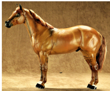
CHAMPION CREAM/DUN COLOR: KID'S SPANISH CASH (CM)

Dun/Gruella (10): 1-Kid's Spanish Cash (CM), 2-Althea (SR), 3-Miss Smokum Royal (CM), 4-Buttercup (NF), 5-Little Smoky (CF), 6-Confederate Gray (LB), 7-Seven S Rebel (LB), 8-My Sweet Wil-liam J (AI), 9-Borealis (VM), 10-Cow-boyography (VM)