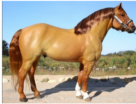
RES. CHAMPION CREAM/DUN: TS GRASSLAND SUNRISE (MP)

Blanket Appaloosa (45): 1-Moonchaser (AI), 2-Rio Grande (CS), 3-Carisbrook Love Affair (JV), 4-CS Witch Wolf (AP), 5-Rio Tigre (LK), 6-D's Stornoway Mister Blue (JV), 7-Dixie's Got the Blues (JV), 8-D.O. Raindance (MH), 9-Powder's Blue Eagle (CM), 10-WBP Hez Sucha Smooth Talker (IC), HMs-Heza Hobo (HC), D.O. Ridge Runner (MH)