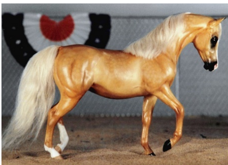
CHAMPION CREAM/DUN: SKS MYSTIC AURA (CM)

Dun/Grulla (11): 1-TS Grassland Sunrise (MP), 2-Mo' Better Blues (JV), 3-D.O. Brista Callienta (MH), 4-Ragnar Lothbrok (KW), 5-Rob Roy (KW), 6-Jemez Antigua (SR), 7-Dun Stormin' (JV), 8-Butterfly Kiss (JV), 9-MN Borg (LeB), 10-Speed Trap (AI), HM-Twist and Shout (SS)