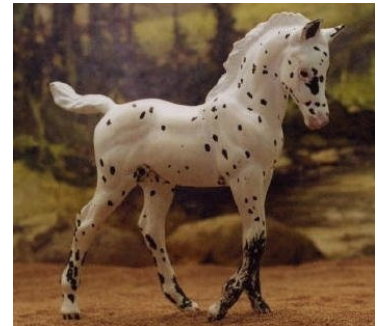
CHAMPION FLOCKED/OTHER CUSTOM: RICATEZ (AP)

Any Other Customization Not Listed Above (4): 1-Ricatez (AP), 2-Jeddak's Rose (CH), 3-Cascade Cebion's Igor (JH), 4-Razelle (AP)