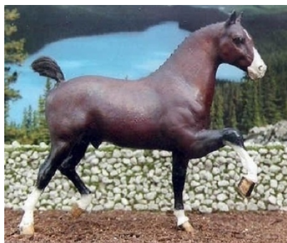
RES. CHAMPION EXTREME REMAKE/REPAINT/HAIR OR SCULPTED MANE/ TAIL: SHALES COMMANDER (IC)

Flocked w/Flocked Mane/Tail: 1-Banshee (LD)