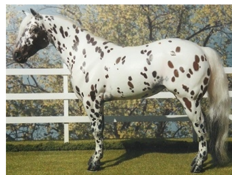
CHAMPION STOCK BREED: POCO DOT (IC)

Other Pure or Mixed Stock Breed (12): 1-D.O. Ridge Runner (MH), 2-Nemesis (LeB), 3-WBP Cinco de Oro (IC), 4-RumbleRex (SM), 5-Regal Ralph (JH), 6-D.O. Copper Dust (MH), 7-Abby Normal (SC), 8-DO Dun IV (JV), 9-D.O. Sabre Dance (MH), 10-Tug Hill Pokey Dott (CM), HMs-Marshall Mellow (SC), Ruby Tuesday (SR)