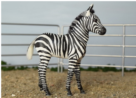
CHAMPION OTHER COLOR: J'S DANDYLION (AI)