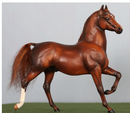
RESERVE CHAMPION LIGHT BREED: JAZZY'S SUN RA (KO)

Thoroughbred (35): 1-In The Dark (SR), 2-Indian Pride (KO), 3-Limestones Red Terror (MR), 4-WV Soliloquy (BR), 5-Makers Mark (LD), 6-Tetrasina (KW),