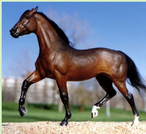
Quick Comet 40 Years Old!