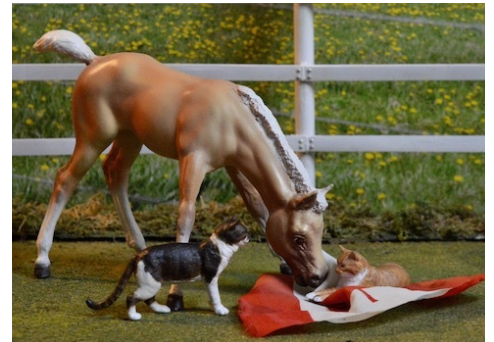
Scenes: Digital & 35mm Photo (4): 1-BHR Salt Water Taffy (BP), 2-Whippoorwill Incognito (BR), 3-Regina Kashmir (BR), 4-Carousel (HC)