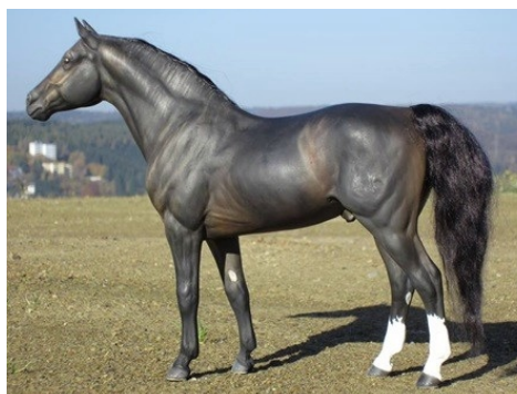
CHAMPION SPORT BREED: AMANTUS VS (SR)

Other Pure or Mix Sport Breeds (22): 1-KT Pink Panther (SC), 2-PR Murphy Brown (JV), 3-Nafzieger (BR), 4-Wine and Roses (BR), 5-Solid Citizen (CM), 6-PR Rosie O'Grady (JV), 7-Fiesta Time (SS), 8-WBP Hez Sucha Smooth Talker (IC), 9-DO Mirabeau Costello (JV), 10-Limestones Lightning (MR), HMs-Trovador Poetic Justice (JV), PR Tantobie Top Honours (JV)