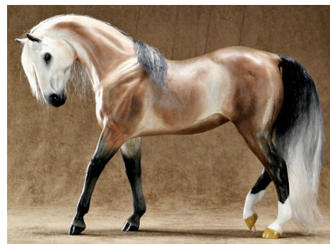
CHAMPION SPANISH: MALEGENA (CM)

Other Pure or Mixed Spanish Breed (13): 1-Malegena (CM), 2-D.O. Sportin' Chance (MH), 3-Jemez Canela Nacar (LeB), 4-Exclusive Vision (SS), 5-Encaje (SS), 6-TS Picante (MP), 7-D.O. Gun-smoke (MH), 8-PR Bosanova Brief Encounter (JV), 9-LJ Zorro (MH), 10-Ice Queen (AI), HMs-KT Danza De Oura (CM), Limestones Free Spirit (MR)