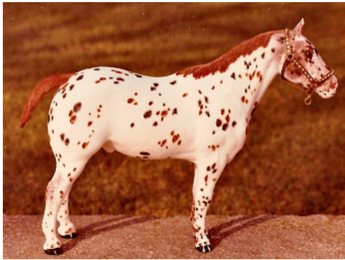
Stock Breeds (1): Kingpin Machado (CM)

Breed Classes: Photo formats other than 35mm or digital