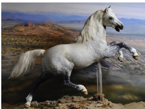
RES. CHAMPION EXTREME REMAKE/REPAINT/HAIR OR SCULPTED M/T: RASTAMAN (BP)