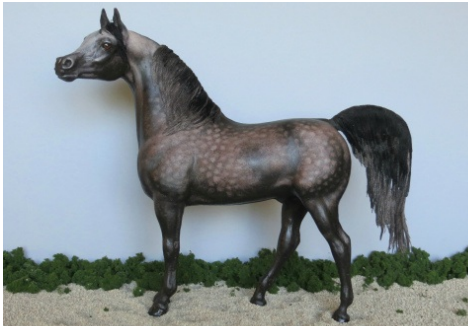
CHAMPION MAJOR REMAKE/REPAINT/HAIR OR SCULPTED MANE/ TAIL: *THE RAISULI (CH)

Major Remake & Repaint w/Non-Hair M/T: Classic and Smaller than Classic: no entries