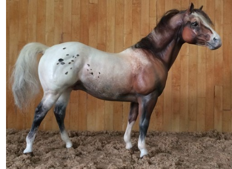
RESERVE CHAMPION REPAINT/HAIR OR SCULPTED M/T: THE PAISLEY PALETTE (SR)

Simple Remake & Repaint w/Hair Mane/Tail: Trad, or Larger (81): 1-Kid's Spanish Cash (CM), 2-Nanty Narking (SC), 3-Apache Red Chief (CM), 4-Althea (SR), 5-J's Enchanted Ecco (AI), 6-Moonlight Drive (LK), 7-J's Party Doll (CM), 8-Red Cloud (SS), 9-Heartsease (AI), 10-Valentino (CH), HMs-Alamance (EH), Murphy's Law (AP)