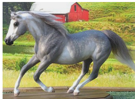
RESERVE CHAMPION SPORT: DIAMOND HANDSOME DEVIL (BH)

CHAMPION SPORT: BIRCHWOOD GEISHA BOY (BP)