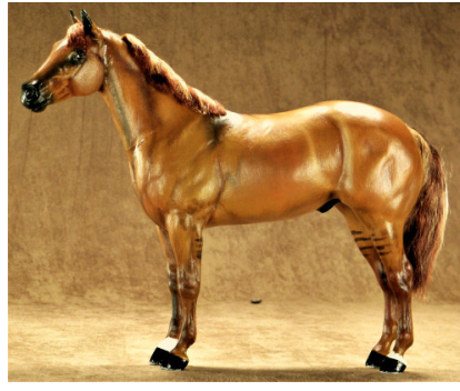
CHAMPION SIMPLE REMAKE/REPAINT/HAIR OR SCULPTED MANE/ TAIL: KID'S SPANISH CASH (CM)

Simple Remake & Repaint w/Non-Hair Mane/Tail: Smaller than Classic (2): 1-Going Formal (BR), 2-Precision (CH)