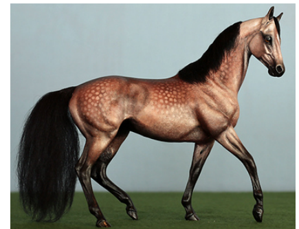
CHAMPION REPAINT/HAIR OR SCULPTED MANE/TAIL: INDIAN PRIDE (KO)

Repaint w/Non-Hair M/T: Smaller than Classic (9): 1-Romeo (CR), 2-Painted Quandry (LeB), 3-Kitty Sonata (IC), 4- Frosted Gold (CR), 5-Titan (IC), 6-Lon- don Fog (LK), 7-Harmonium (LK), 8-CL Fairway (HC), 9-Tiny Bud (HC)