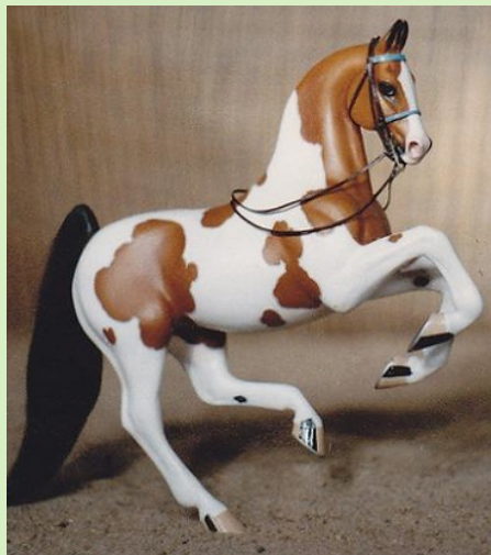
Calendar Girl 35 Years Old!