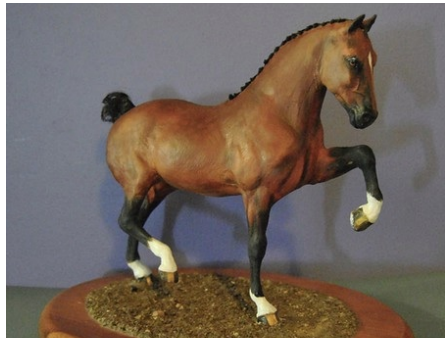
BIRCHWOOD GEISHA BOY