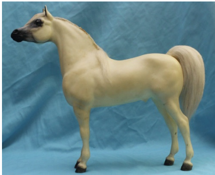
RES. CHAMPION CUSTOM W/FACTORY PAINT: CONSTELLATION'S IMAGE (SS)

Repaint: Trad. or Larger (16): 1-Matar (LoB), 2-AI Dhahab al'Aswad (SM), 3-Carnival King (LB), 4-Tejas Treasure (VM), 5-*Rebel Bint Sahra (CH), 6-Hi Ho Hastings (LB), 7-Korsakov (CH), 8-Azure Lady (SS), 9-Disco Par T (IC), 10-Poco Graybar (LoB), HMs-Sheneyn Alar (CH), Candee (CF)