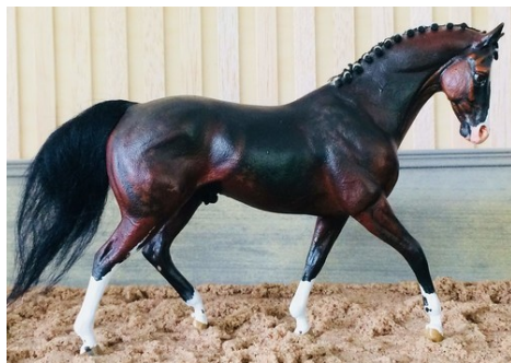
RESERVE CHAMPION SPORT BREED: IN THE DARK (SR)

Paso Fino/Peruvian Paso (12): 1-Marquesa (CM), 2-Huaricanga (KW), 3-D.O. Brista Caliente (MH), 4-LJ Abricotine Bleu (JV), 5-TS Jalapeno (MP), 6-Noche Estrallado (SS), 7-TD Kalife's Secret Wish (LeB), 8-PR Balenciaga Brio (JV), 9-TS Crystal Conchita (MP), 10-Red Sonja (HC), HM-Bolero (HC)