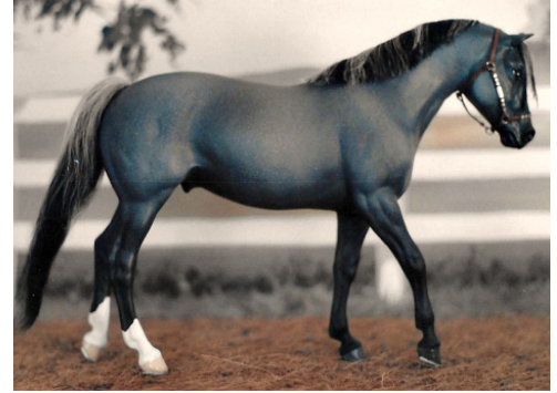
Geldings (5): 1-Sweet William J (CM) [pictured at top of next column], 2-Excel (JP), 3-Smoke N' Iron (IC), 4-Witchita Rock (CM), 5-TS Chasing Rockets (JP)