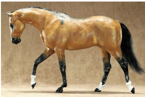
RESERVE CHAMPION OTHER COLOR: TUG HILL BY DESIGN (CM)

1980s COLOR DIVISION OVERALL CHAMPION: ARAHAEL (LoB)