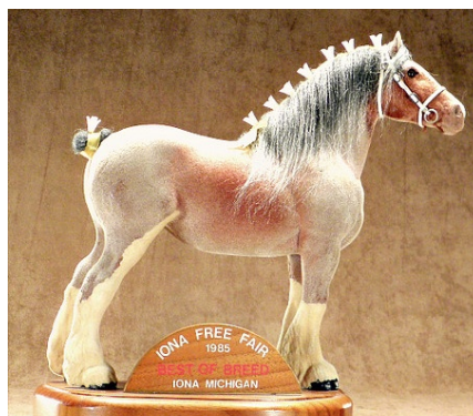
RES. CHAMP FLOCKED/OTHER CUSTOM: LADY OF TRIESTE (CM)