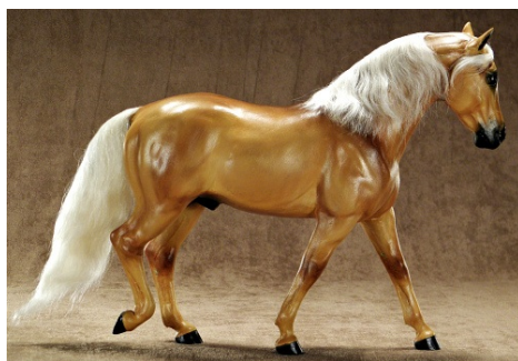
RESERVE CHAMPION GAITED BREED: FOXY MOONSHINE (CM)

Clydesdale/Shire (14): 1-RM Nuclear Winter (KW), 2-RAS Elian Demoiselle (CM), 3-TS Bonnie Red (MP), 4-TS Annie Red (MP), 5-PR Burning Blue Soul (JV), 6-Limestones Challenger (MR), 7-D's Hillbilly Hollywood (VM), 8-SR Mighty Mo (SS), 9-CS Dark Lord (AP), 10-Limestones Heritage (MR), HMs-Parsons Kloof (SC), Drambuie (BR)