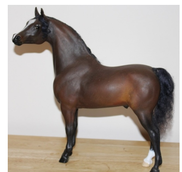
RESERVE CHAMPION SIMPLE REMAKE/REPAINT/HAIR OR SCULPTED MANE/TAIL: NHI VANYE I CHYYA (LoB)