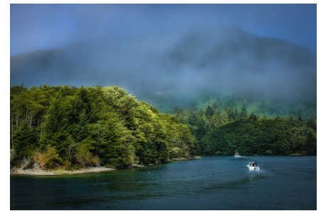
Into the Fog - 27 Rose Epps