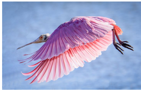
Roseatte Spoonbill - 27 Dolph McCranie