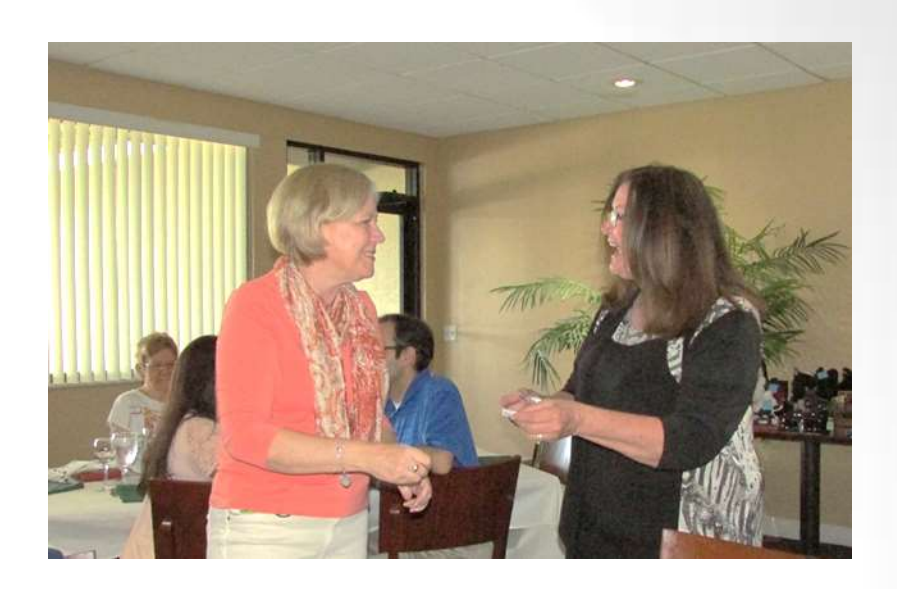
Enjoying the company of Scottie friends!