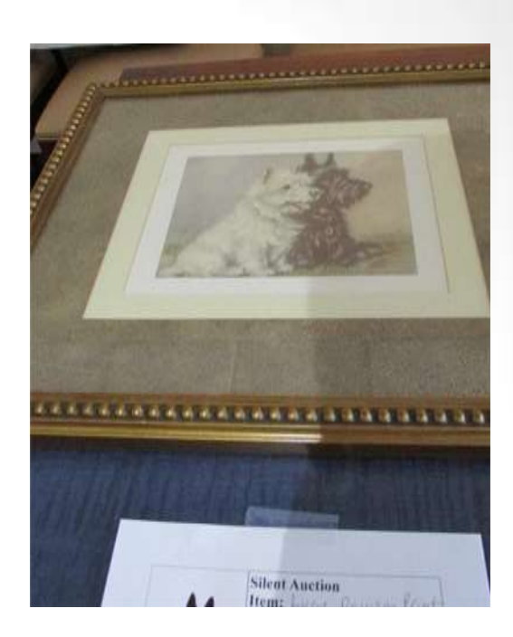
These are some of the items donated for the "silent auction"!