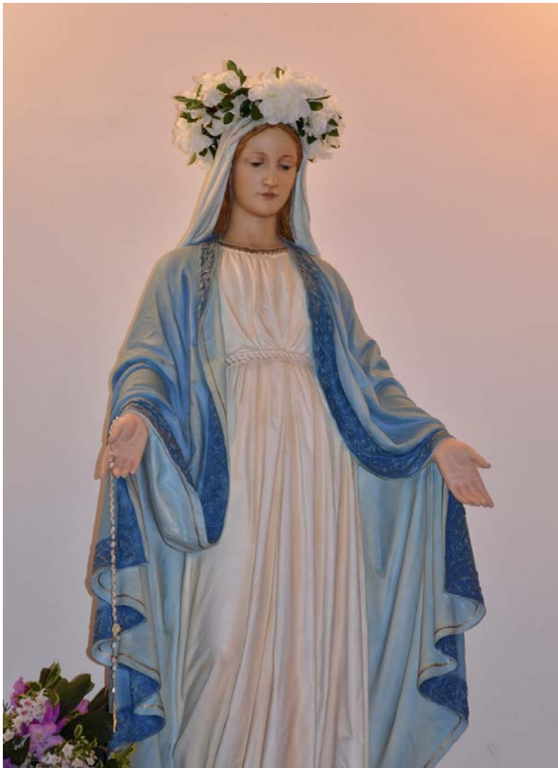
Our Lady Star of the Sea Solomons, MD