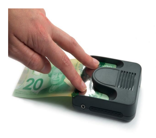
Fig.1: Bank Note Reader [21]

The text from the image can be detected by using sparse representation, Novel edge based method and Unsupervised feature learning method [18, 17, and 16].T.A.More et al. has proposed embedded technology.In which ARM 11 microcontrollercan be used for image and video data extraction. [19].SiddharthMody et al. developed a portable "Text-to-Speech Converter".Speech processor converts the valid text at the input via keyboard into speech [20].