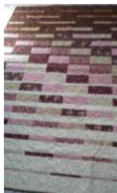
Modern strippy (light to dark, single bed size) 56"x85" value $410.00