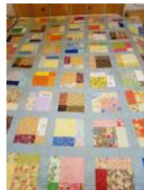
Size 66" x 72" Value $375.00