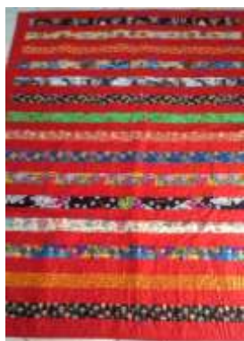
Red strippy (lap or small bed) 44" x 60" value $230.00

If you wish a quilt for a raffle or silent auction for your organization in the Durham region, we have a couple on hand you can apply for. I have the forms to send you to apply. See photos below. More will be quilted this fall.