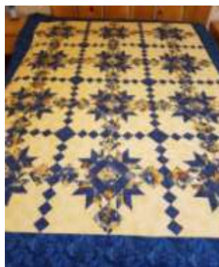
Size 60" x 78" Value $400.00