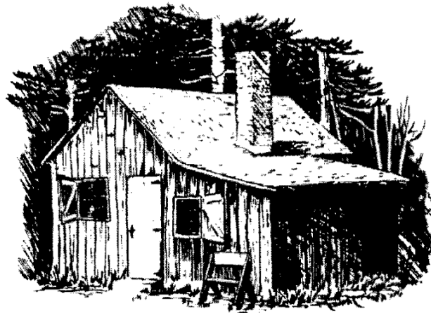
"The Shack" Sand County, Wisconsin

For more information call the Program Administrator at 815-544-2677