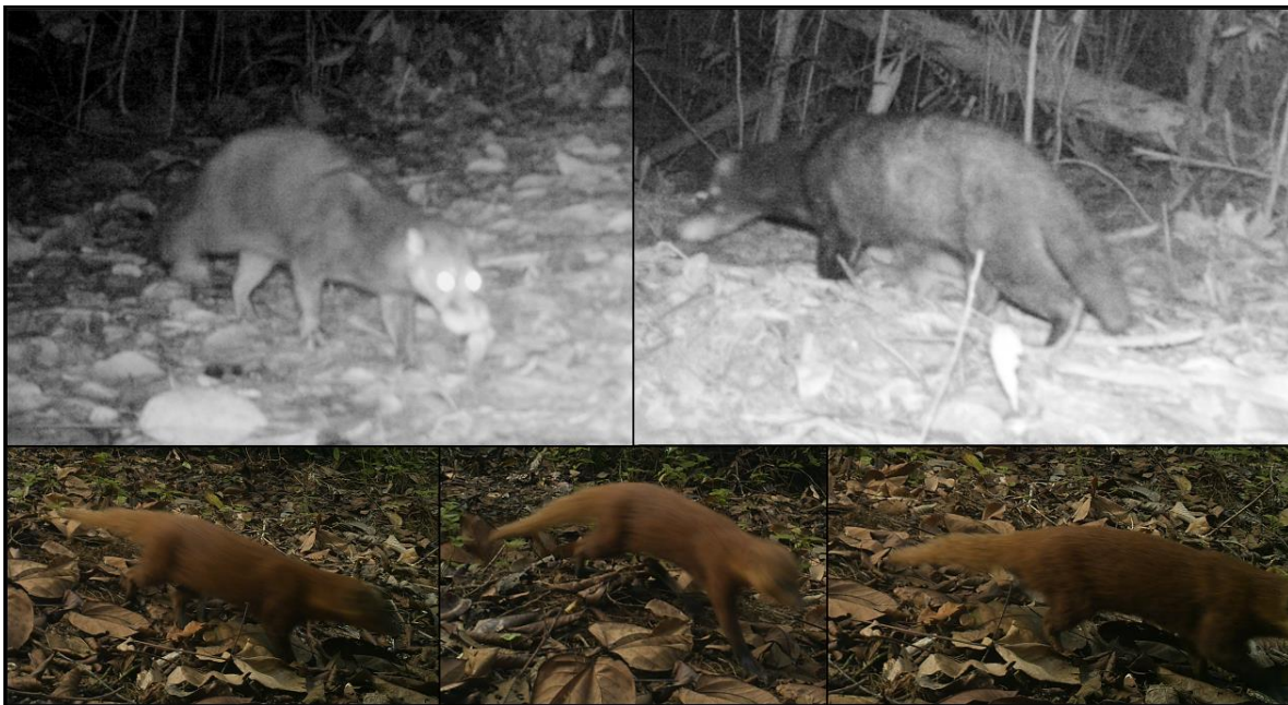
Fig. 2. Otter Civet Cynogale bennettii (top; photographed 7 July 2013) and Collared Mongoose Herpestes semitorquatus (bottom; photographed 18 August 2013) recorded by camera-traps in the Bukit Tigapuluh Landscape, Jambi, Sumatra.

Fifty percent of all detected small carnivores are either listed on The IUCN Red List of Threatened Species as Near Threatened (Banded Civet Hemigalus derbyanus , Collared Mongoose and Short-tailed Mongoose Herpestes brachyurus ), Vulnerable (Oriental Small-clawed Otter and Binturong Arctictis binturong ) or Endangered (Otter Civet) (IUCN 2019). Our findings underline the importance of the Bukit Tigapuluh Landscape, particularly the surveyed southern part, for the conservation of small carnivores and other threatened mammals.