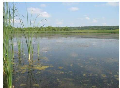
Fig. 2: Wetland restoration