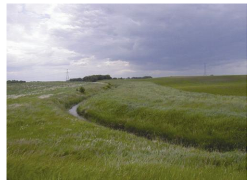
Fig. 3: Riparian buffer