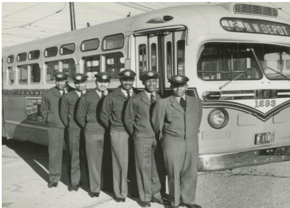
AMALGAMATED TRANSIT UNION LOCAL 1091