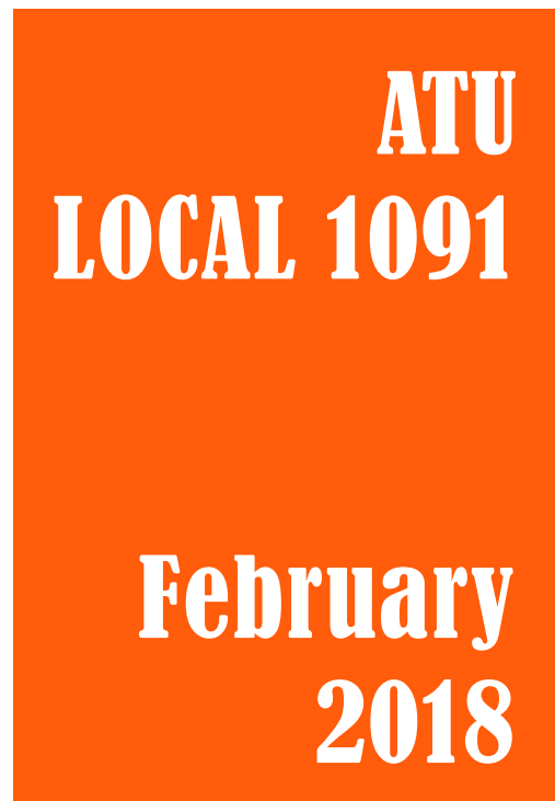
IN THIS ISSUE