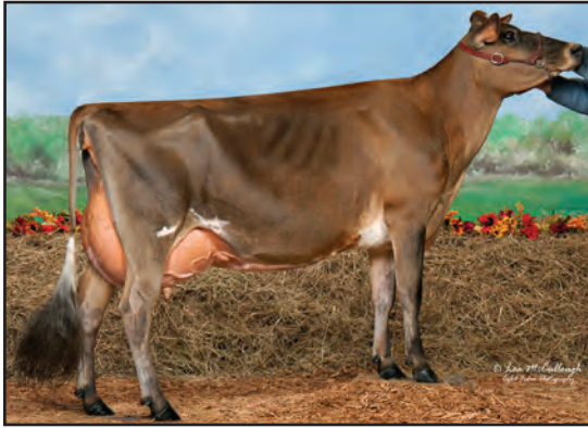
HOLLYLANE CENTURION EMERALD-ET, E-92% DAM OF LOT 911