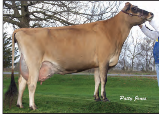
HOLLYLANE RENE ESMERALDA, EX 93-4E (CAN) GREAT-GRANDAM OF LOT 16007