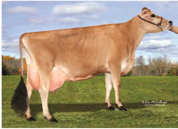
HEARTLAND SAWYER SUNCREST, E-90% SISTER TO THE GRANDAM OF LOT 17070