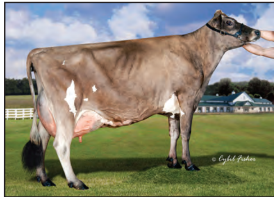
BW LEGION CLEO ET31-ET, E-91% SISTER TO THE GRANDAM OF LOT 17060