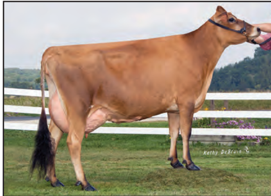
ROCHA IMPULS WHITNEY, VG-89% GRANDAM OF LOT 9048