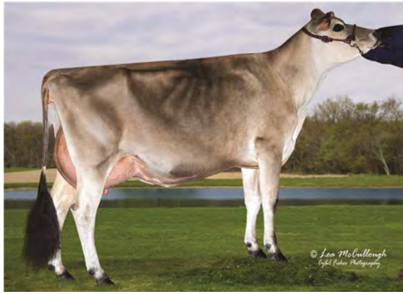
MILK-N-MORE SULTAN BRYNN-ET, E-91% FULL SISTER TO THE GREAT-GRANDAM OF LOT 17009