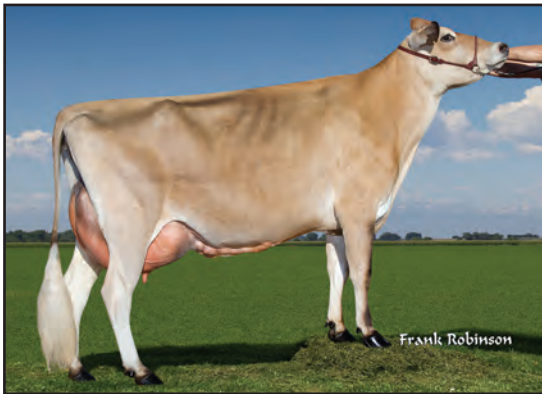
BW LEGION GALIANA ET629-ET, E-94% SISTER TO THE GRANDAM OF LOT 17060