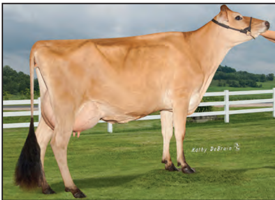
TJF/LEE RILEY MAMME 938-ET, VG-88% SISTER TO THE GRANDAM OF LOT 16032