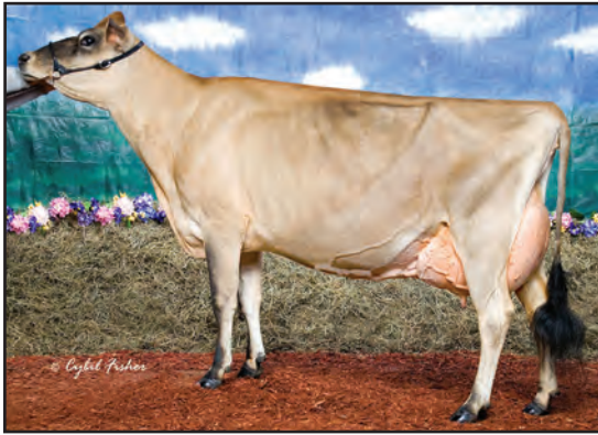
LLOLYN JUDE GRIFFEN-ET, E-95% GRANDAM OF LOT 17003