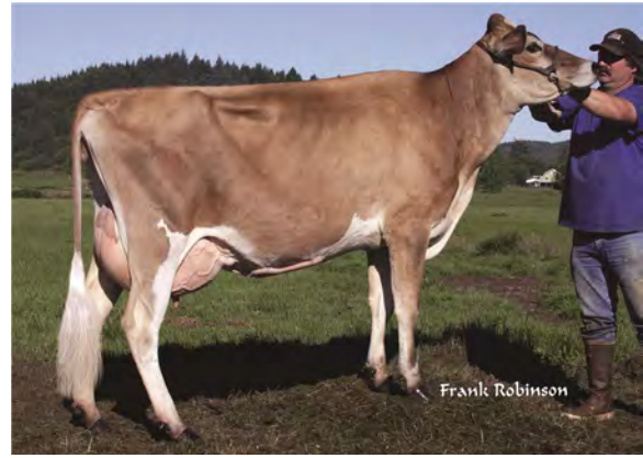
ROCHA HALLMARK WHISTLE, E-91% FOURTH DAM OF LOT 17074