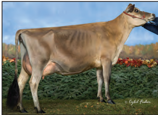
WILCO DELUXE ZAP {4}-ET, E-94% SISTER TO THE GRANDAM OF LOT 16002