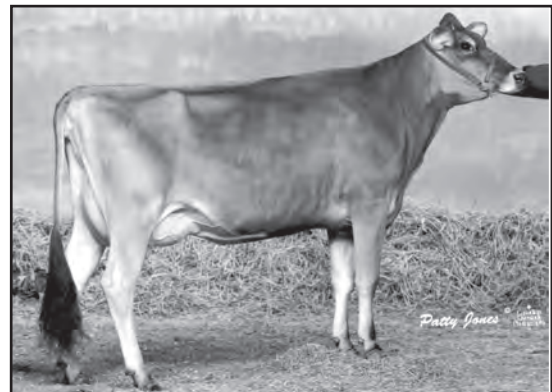
LLOLYN FRED'S GOLD 31B, EX 2E (CAN) GRANDAM OF LOT 2262