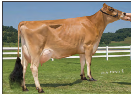
TJF/LEE LEXNTN MAMME 792, VG-87% SISTER TO THE GRANDAM OF LOT 16032