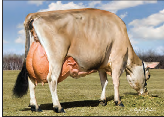
RATLIFF F PRIZE KANSAS-ET, E-95% SISTER TO THE GRANDAM OF LOT 9061