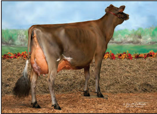
HOLLYLANE CENTURION EMERALD-ET, E-92% GRANDAM OF LOT 16007