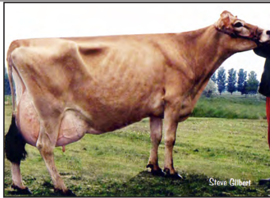
GRAZELAND BOLD DAVITA, E-91% GRANDAM OF LOT 785