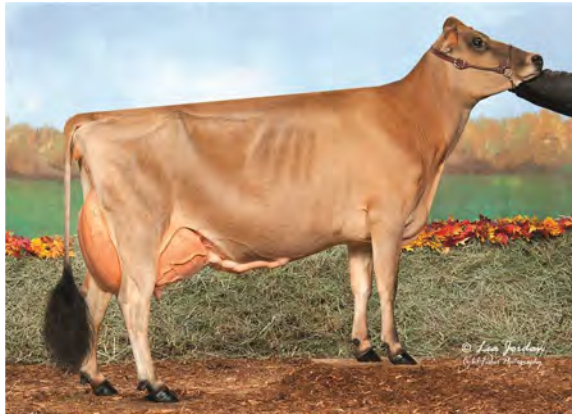
RUHLS RANCH RILEY RACHAEL, E-92% SISTER TO THE DAM OF LOT 18018