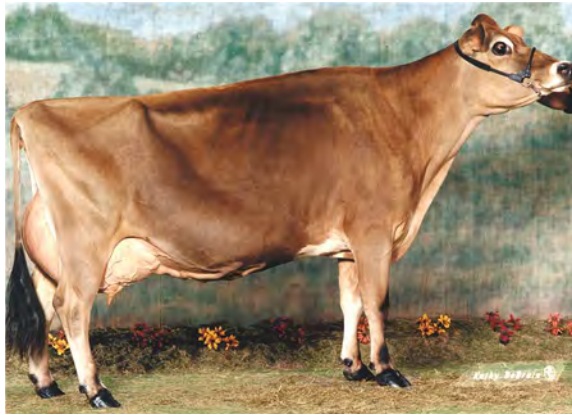
AVONLEA D JUDE KARMEL, E-94% FOURTH DAM OF LOT 18039