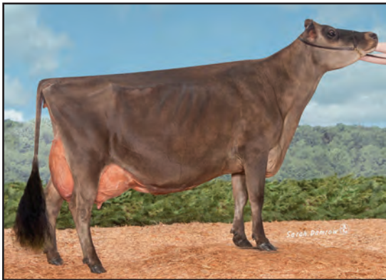
RATLIFF REN KENDRA-ET, E-95% SISTER TO THE GRANDAM OF LOT 9061