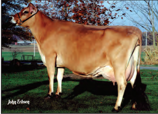
VANTAGE LEMVIG MAMME, E-90% GRANDAM OF LOT 17064