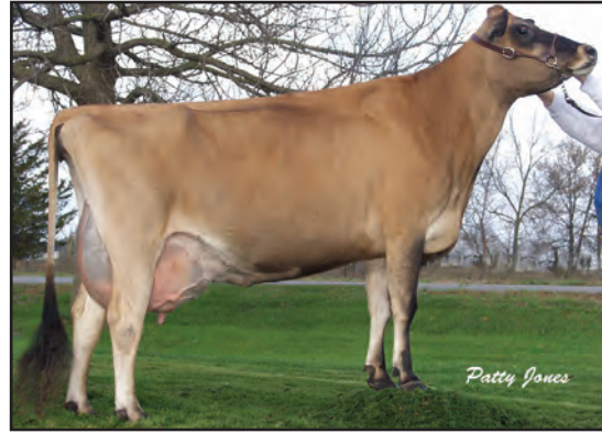
HOLLYLANE RENE ESMERALDA, EX93-4E (CAN) GRANDAM OF LOT 911