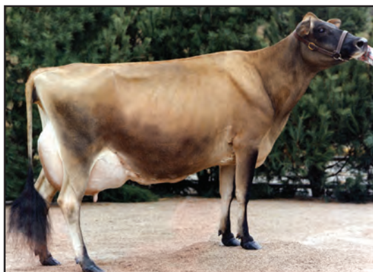
BUTTERFIELD REWARD POLLYANNA, E-95% FOURTH DAM OF LOT 17024