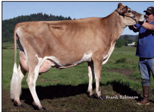
ROCHA HALLMARK WHISTLE, E-91% GREAT-GRANDAM OF LOT 9048