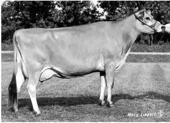
GIL-BAR KEYNOTE HARMONY, E-93% FOURTH DAM OF LOT 9111