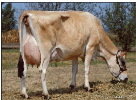
AUBURNVUE SOONER GINGER, E-93% FOURTH DAM OF LOT 11813