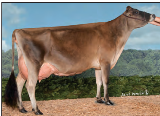
SHERONA MINISTER ANGEL, E-94% SISTER TO THE GRANDAM OF LOT 63