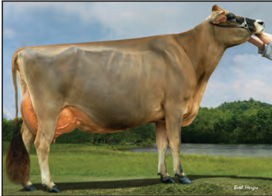
BUDJON-VAIL JADE GIANNA-ET, E-94% SISTER TO THE DAM OF LOT 17003