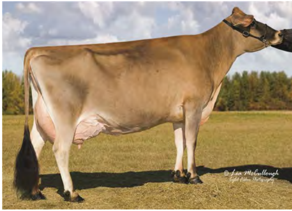
BUTTERFIELD BARBER PRAYER, E-90% GREAT-GRANDAM OF LOT 17058