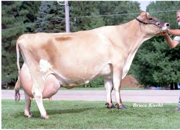
HILLVIEW TRADER BABKA, E-92% GREAT-GRANDAM OF LOT 9049