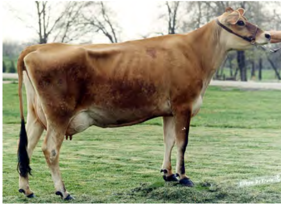
MAPLE LAWN ILL LEGEND THYME-ET, E-93% FIFTH DAM OF LOT 19145