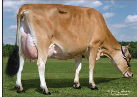
TJF/LEE ACTION MAMME 840-ET, E-90% SISTER TO THE GRANDAM OF LOT 14008