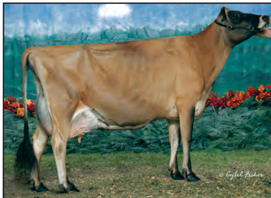
BROWNLANE ANGELA, E-95% GRANDAM OF LOT 9039