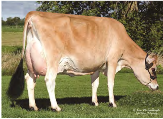
DODAN WILD ECHO ZIP ZILCH, VG-88% SISTER TO THE GRANDAM OF LOT 17002