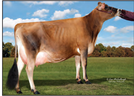
HEARTLAND TOPEKA TRIPOLI-ET, E-90% SISTER TO LOT 15027