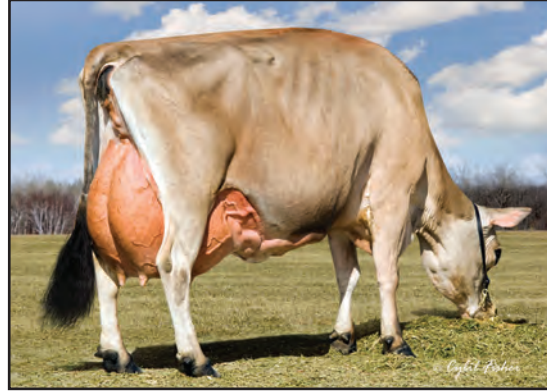
RATLIFF F PRIZE KANSAS-ET, E-95% SISTER TO THE GRANDAM OF LOT 16010