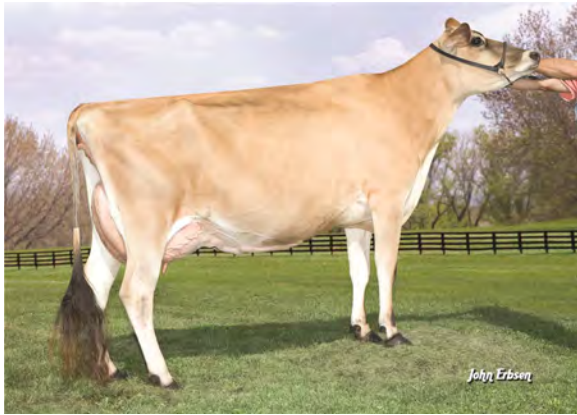
WF COUNCELLER ANAKORNIKOVA-ET, E-93% FOURTH DAM OF LOT 17033