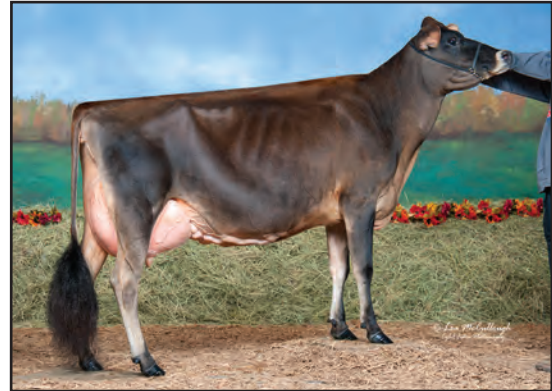
BUDJON-VAIL SAMBO GLENNA-ET, E-92% SISTER TO THE DAM OF LOT 17003