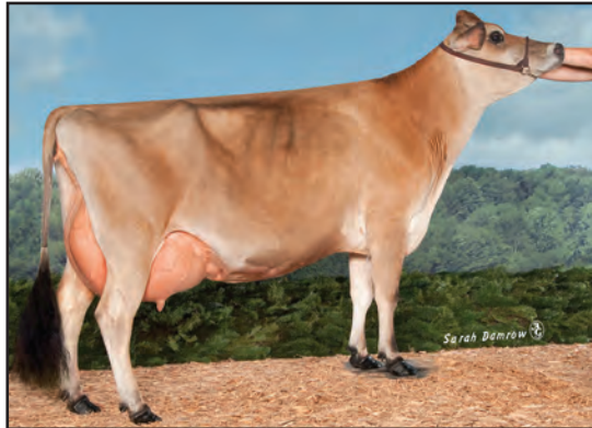
PAGE-CREST PREMIUM ZEPHYR {5}, E-90% DAM OF LOT 16002