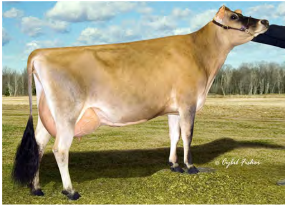
MICHAEL CENTURION DARLA, E-93% FOURTH DAM OF LOT 15026