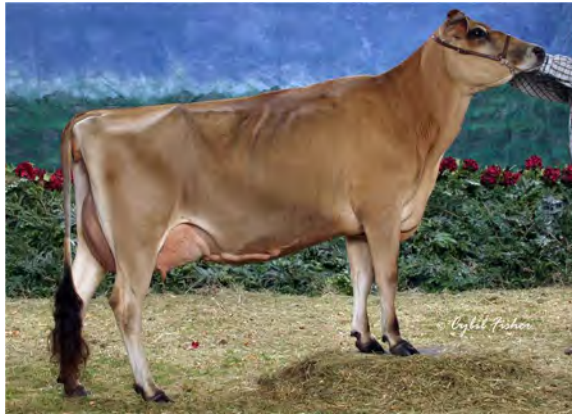
GIL-BAR TOP PRIZE FLIRT, E-90% GREAT-GRANDAM OF LOT 17044