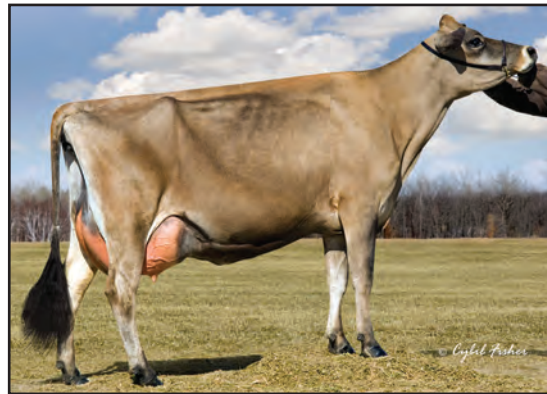
RATLIFF REN KIWI-ET, E-93% SISTER TO THE GRANDAM OF LOT 9061