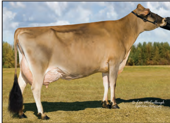
BUTTERFIELD BARBER PRAYER, E-90% GRANDAM OF LOT 17024