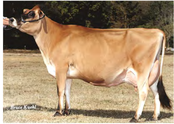
BUTTERFIELD CHAMPION PRAIRIE, E-94% FOURTH DAM OF LOT 17058