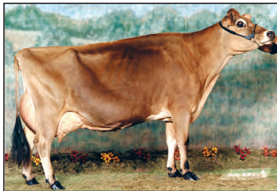
AVONLEA D JUDE KARMEL, E-94% GREAT-GRANDAM OF LOT 9061