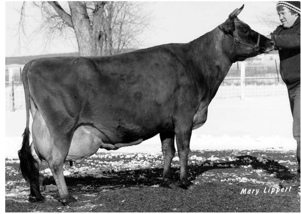
ROYAL VENA HOPE, E-90% FIFTH DAM OF LOT 9111