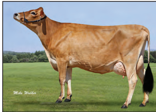
TJF/LEE VALENTINO MAMME 980-ET, E-90% SISTER TO THE GRANDAM OF LOT 16032