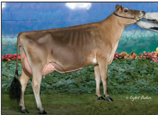
RATLIFF SAMBO KARLA-ET, E-93% SISTER TO THE GRANDAM OF LOT 9061