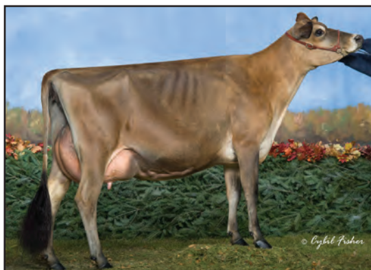
WILCO DELUXE ZAM {4}-ET, E-91% SISTER TO THE GRANDAM OF LOT 16002