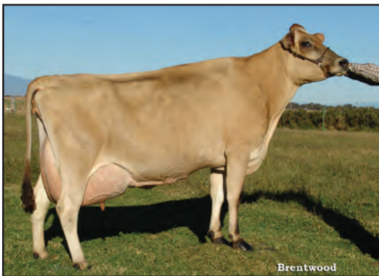
BW CENTURION ENID K783, E-94% SISTER TO THE GRANDAM OF LOT 17060