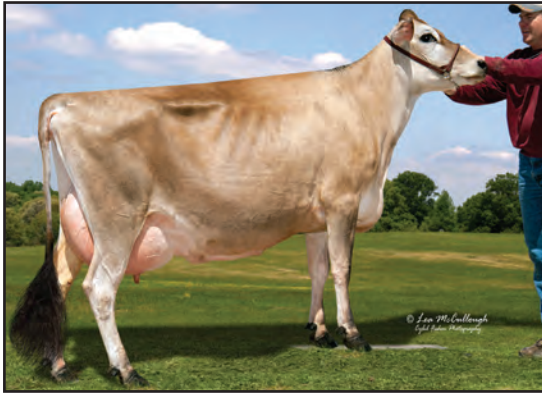
TENN LOUIE 260 HEH MAID, VG-86% DAM OF LOT 15027