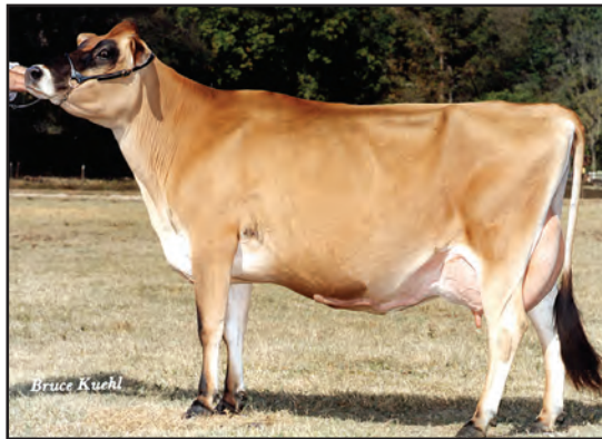
BUTTERFIELD CHAMPION PRAIRIE, E-94% GREAT-GRANDAM OF LOT 17024