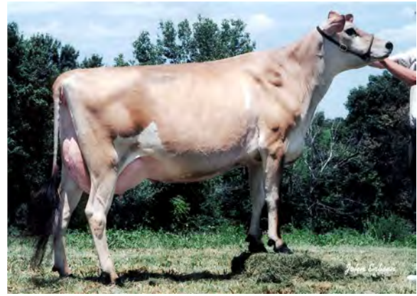
CENTURION DC DELLA, E-90% FIFTH DAM OF LOT 15026