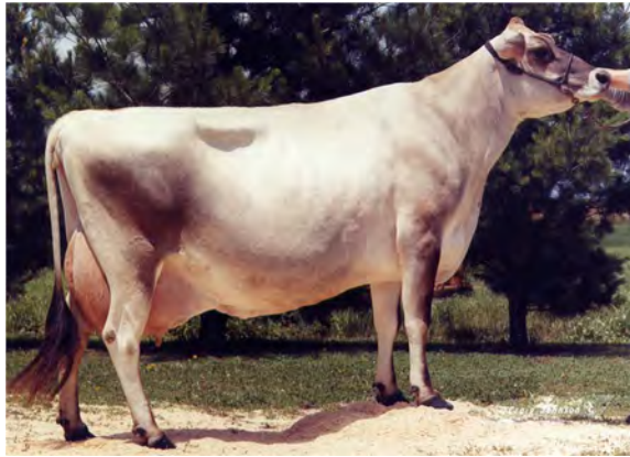
PUMPKIN HILL LEGEND ROMELA-P, E-91% FOURTH DAM OF LOT 9191