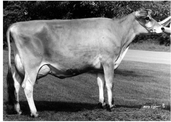
HILLVIEW BEACON BEST {3}, E-90% SIXTH DAM OF LOT 9049