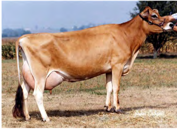
MAPLE LAWN LESTER LONI, E-92% FOURTH DAM OF LOT 18023