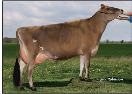
BUDJON SULTAN GUCCI-ET, E-93% SISTER TO THE DAM OF LOT 17003