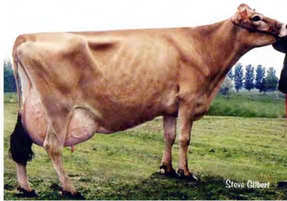
GRAZELAND BOLD DAVITA, E-91% GREAT-GRANDAM OF LOT 16008