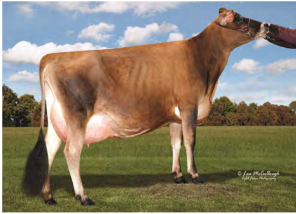
HEARTLAND TOPEKA TRIPOLI-ET, E-90% SISTER TO LOT 16041