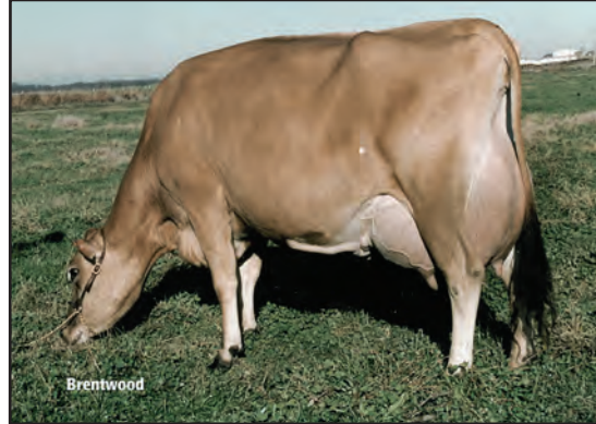
BW BERRETTA PRIZE G525, E-92% FOURTH DAM OF LOT 17060