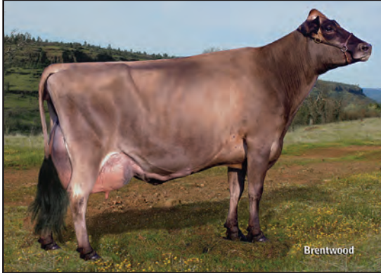
BW AVERY KATIE ET121-ET, E-93% GREAT-GRANDAM OF LOT 17060