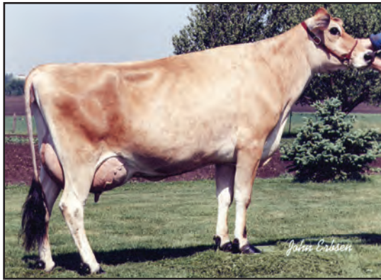
HOMWOOD BRETS HARBINGER, E-91% FOURTH DAM OF LOT 442