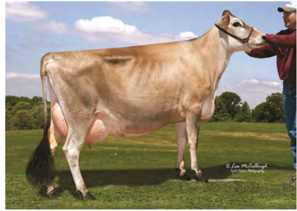
TENN LOUIE 260 HEH MAID, VG-86% DAM OF LOT 16041