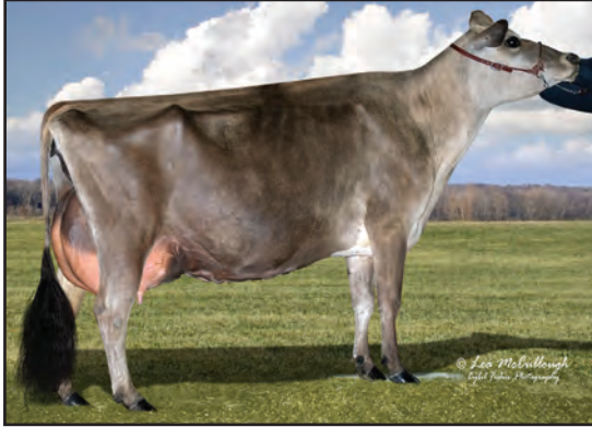
RENN KANDIE OF RATLIFF, E-95% SISTER TO THE GRANDAM OF LOT 16010