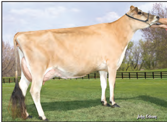
WF COUNCILLER ANAKORNIKOVA-ET, E-93% GREAT-GRANDAM OF LOT 63