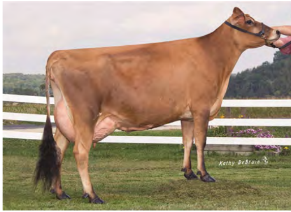
ROCHA IMPULS WHITNEY, VG-89% FOURTH DAM OF LOT 17047