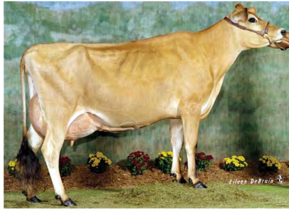
HURONIA CENTURION GINGER 17H, E-92% GREAT-GRANDAM OF LOT 17008