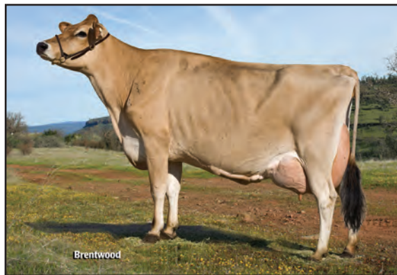
BW JACE CARLY ET344-ET, E-91% SISTER TO THE GRANDAM OF LOT 17060