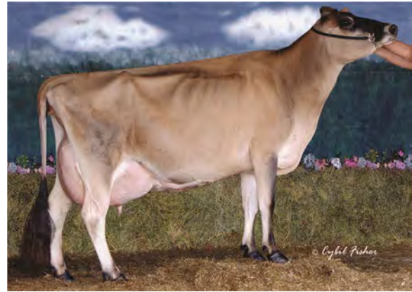
GIPRAT REN ANASTASIA-ET, E-95% FIFTH DAM OF LOT 17033