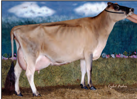
GIPRAT RENN ANASTASIA-ET, E-95% FOURTH DAM OF LOT 63