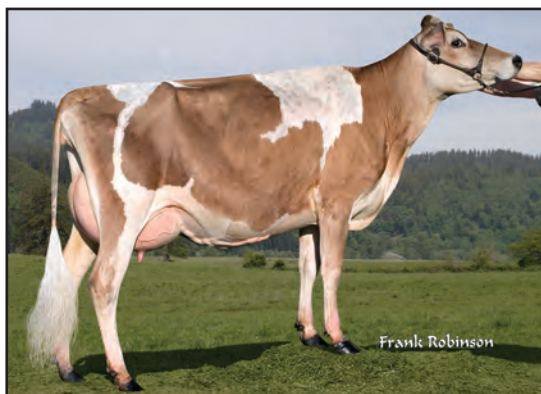
ROCHA FUTURITY WINNIFRED-ET, VG-88% SISTER TO THE GRANDAM OF LOT 9048