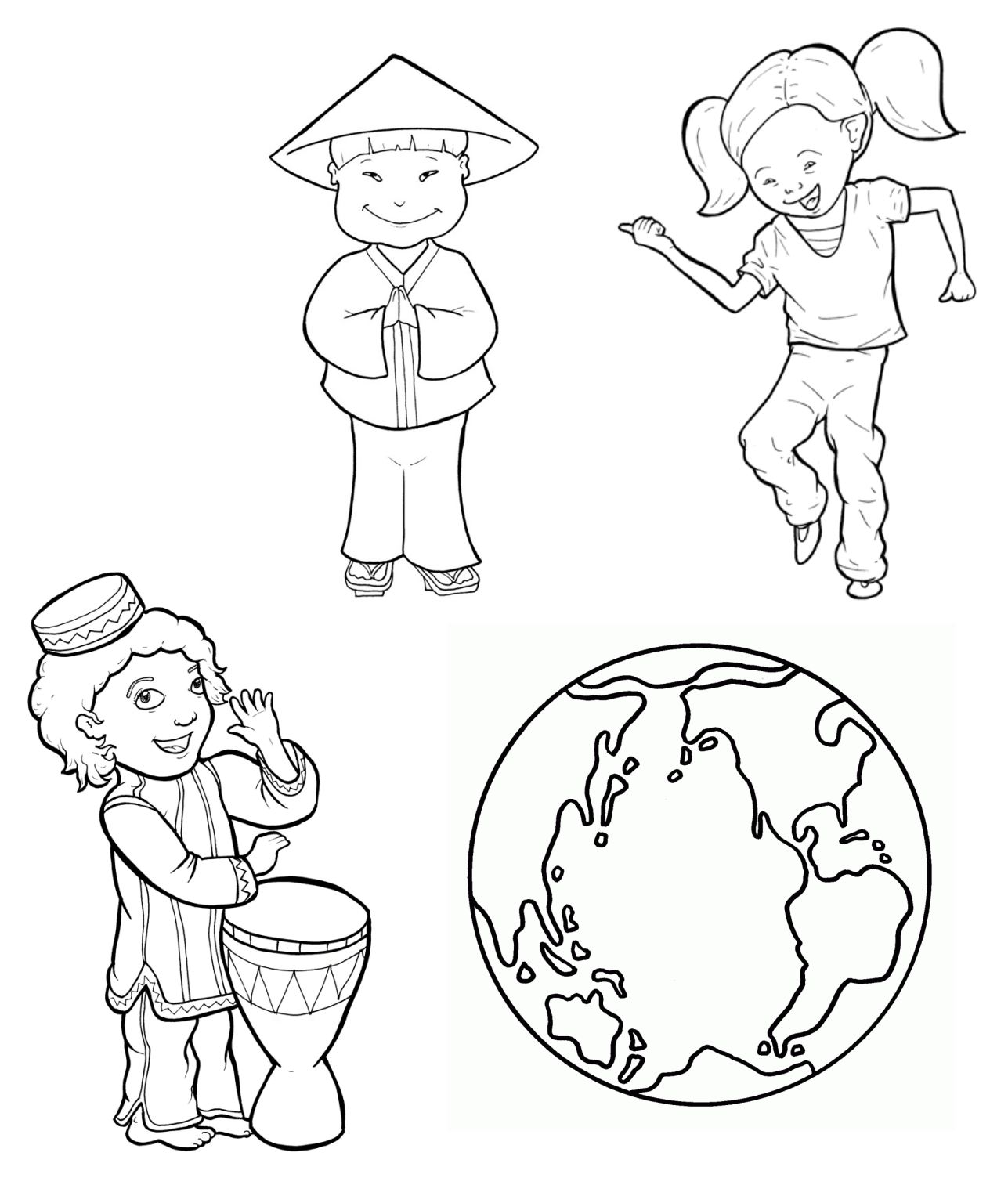
Jesus said, "Go and make disciples of all nations." Matthew 28:19