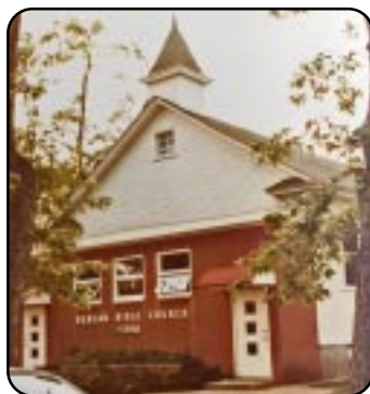
Berean Bible Church on the corner of 19th & Maple.

Parkside Bible Church traces its founding back to the Berean Church in downtown Holland. That church was established in 1920, changed its name and moved to the present location on James Street. Committees are being formed and plans made to prepare to celebrate the one-hundred year anniversary. Watch for additional information about this special event.