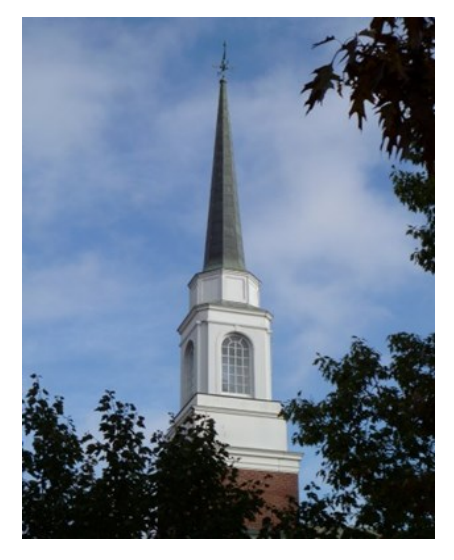
September 2024 Volume 70, No. 8