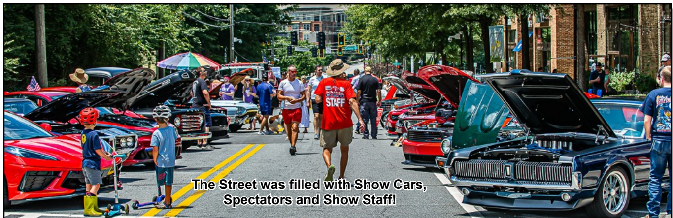
The Street was filled with Show Cars, Spectators and Show Staff!