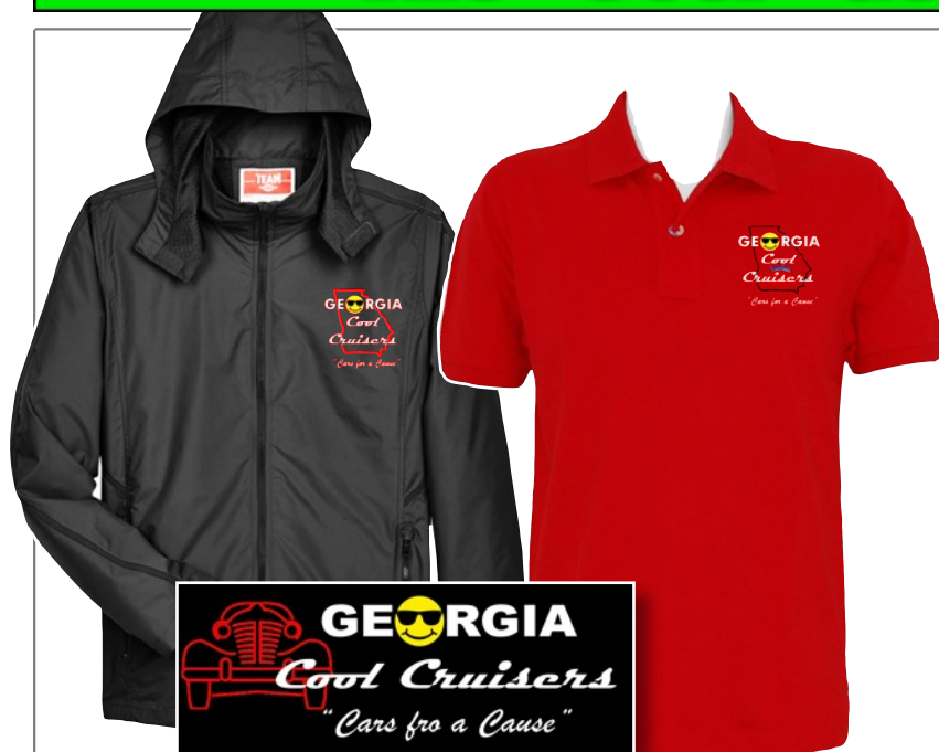
Jacket Back Design