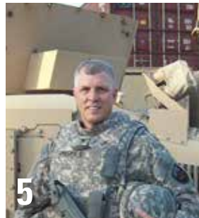
Find more photos on page 56 or online at www.ocbar.org .