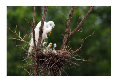
Can You Say MaaaMa? - 27 Cheryl Callen