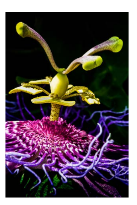
Passion Flower - 27 Brian Loflin