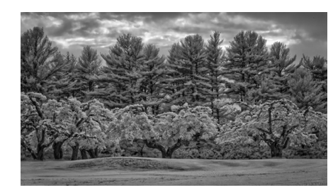
Old Apple Trees - 27 Kathy McCall