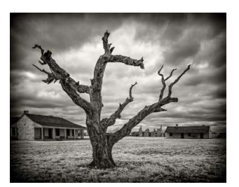
Tree ar Fort McKavett - 27 Pete Holland