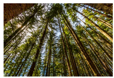
Sitka Spruce Trees - 26 Kushal Bose