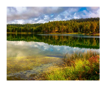
Reflected Splendor - 26 Linda Sheppard