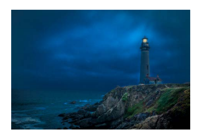
Stormy Night - 27 Ken Uplinger