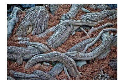
Roots - 27 Lois Schubert