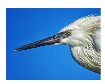
Egret - 27 Paul Munch