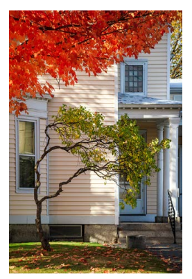
Gnarly Tree - 26 Rose Epps