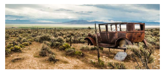
Busted in Nevada - 27 Ken Uplinger