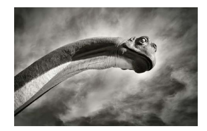
Dinosaur Valley - 27 Pete Holland