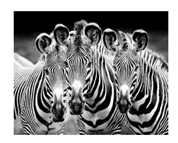
Looking at You - 27 Leslie Ege