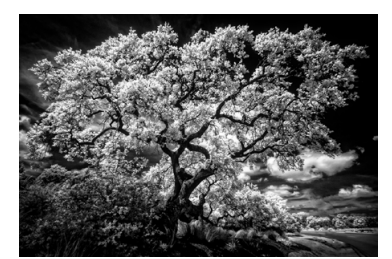
Gnarled Tree - 27 Linda Sheppard