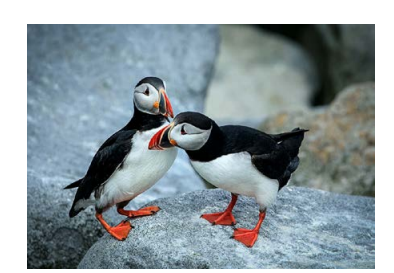
Puffin Talk - 27 Rose Epps