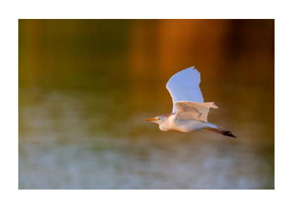
Morning Flight - 27 Cheryl Callen