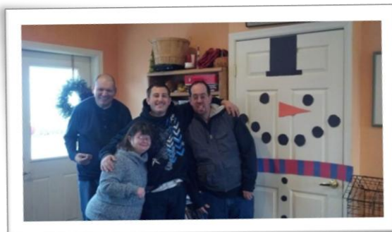
Decorating for the holidays