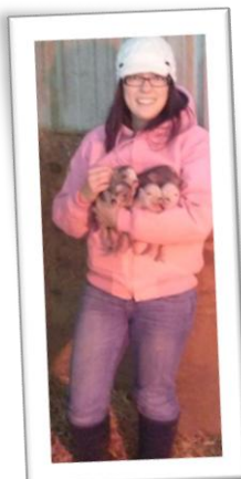
Caring for the new baby lambs, piglets, and chicks!