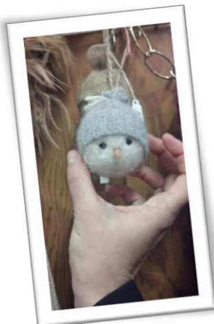
Making Christmas Ornaments out of our wool