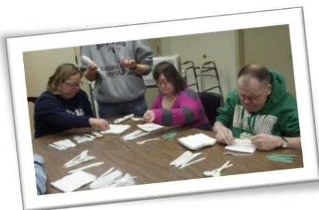
Volunteering at Lebanon County Christian Ministries