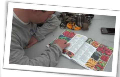
Picking out seeds