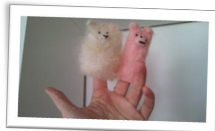
Making finger puppets out of our wool