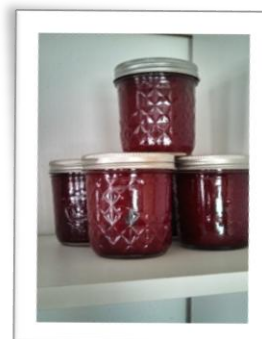
Making hot pepper jam