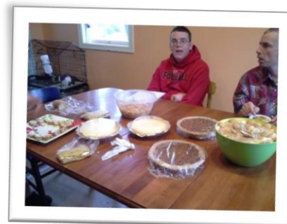
Enjoying treats at the holiday party