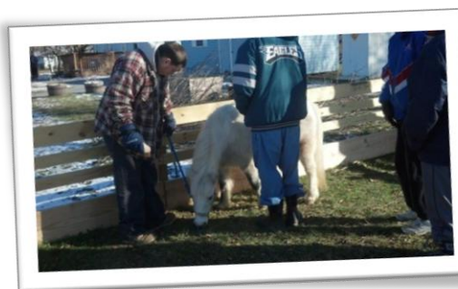
Brushing and cleaning Bunny