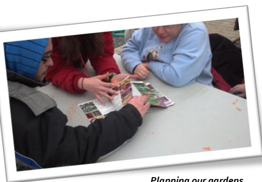
Planning our gardens