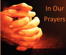
In Our Prayers