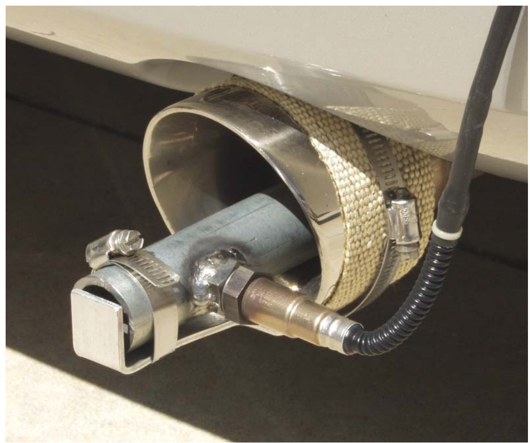
Figure 2 – Exhaust Sniffer Vehicle Installation