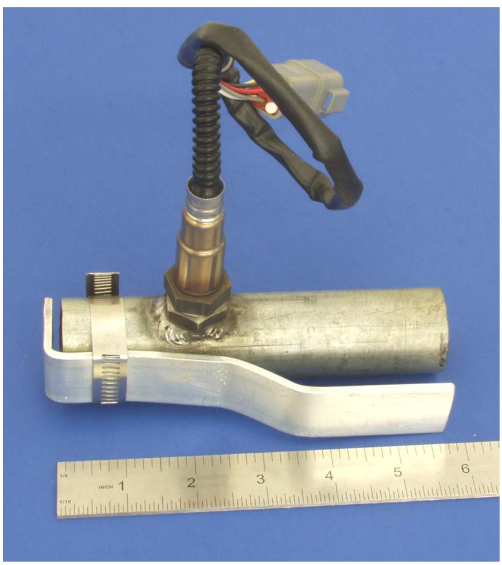
Figure 1 – Automotive Exhaust Sniffer

The exhaust sniffer is shown in Figure 1. It is constructed from a 6" length of 1" ID steel pipe. A 3/4" hole is drilled approximately 2" from the end and an 18 x 1.5 mm weld nut (our P/N EGO-WELD-NUT) is welded onto the pipe. After welding, an 18 x 1.5 mm tap must be used to clean the threads.