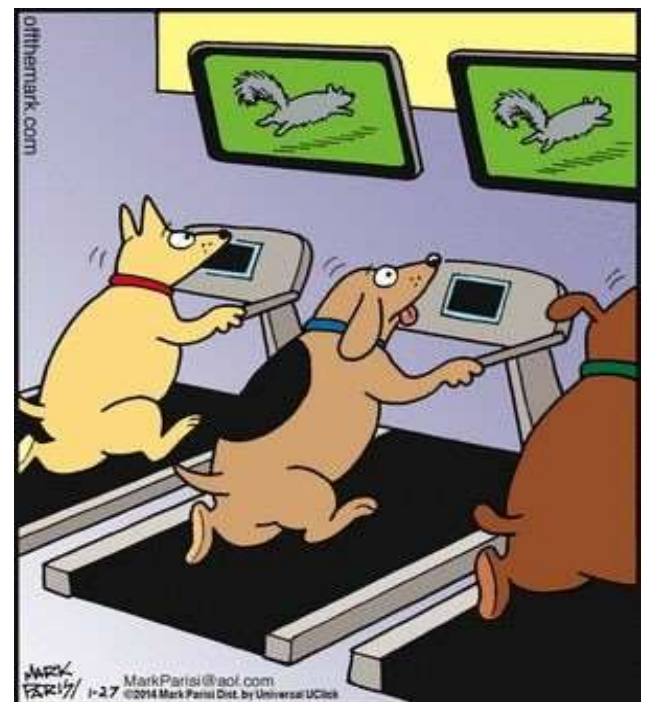
Dog treadmills GUESS WHO?