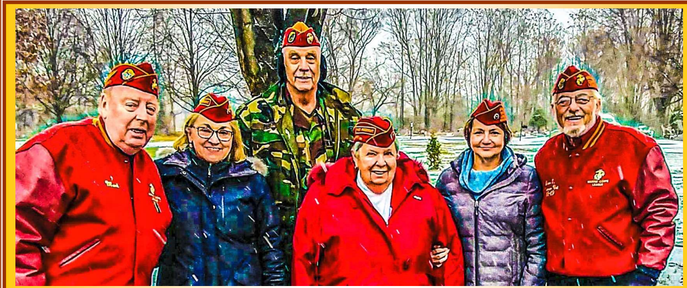
Wreaths Across America, Clinton Grove cemetery