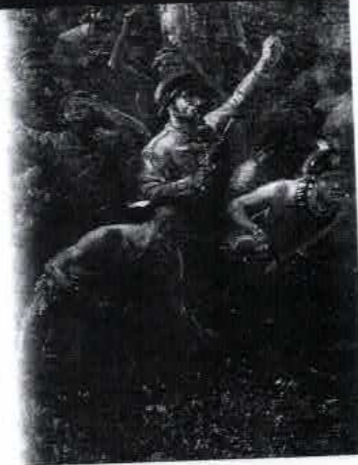
This 1903 painting by Edward Deming shows Charles de Langlade attacking British forces in 1755.

This section describes the war, in which French forces fought British forces in North America. Each side had Native American allies. Charles de Langlade led several successful attacks against the British. But in the end, he saw the British drive French armies from the continent.