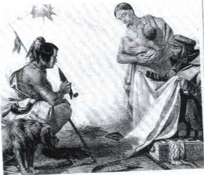
A French trader visits a Native American family.

The British traders left, and the French built forts to protect the region linking their Canadian and Louisiana settlements. This upset the Virginia colony, which claimed title to the land. In 1753, the lieutenant governor of Virginia sent a small group of soldiers to tell the French to