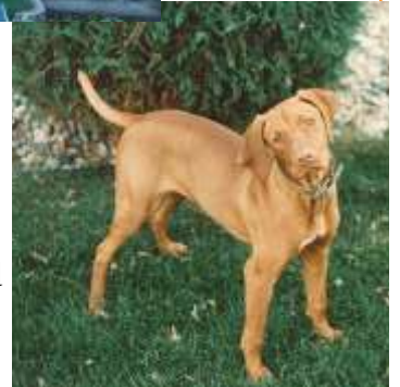
Carol’s favorite pup - “Spike” (German Vizsla)