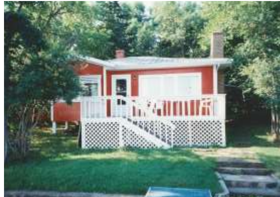
Lake Metigoshe Cabin