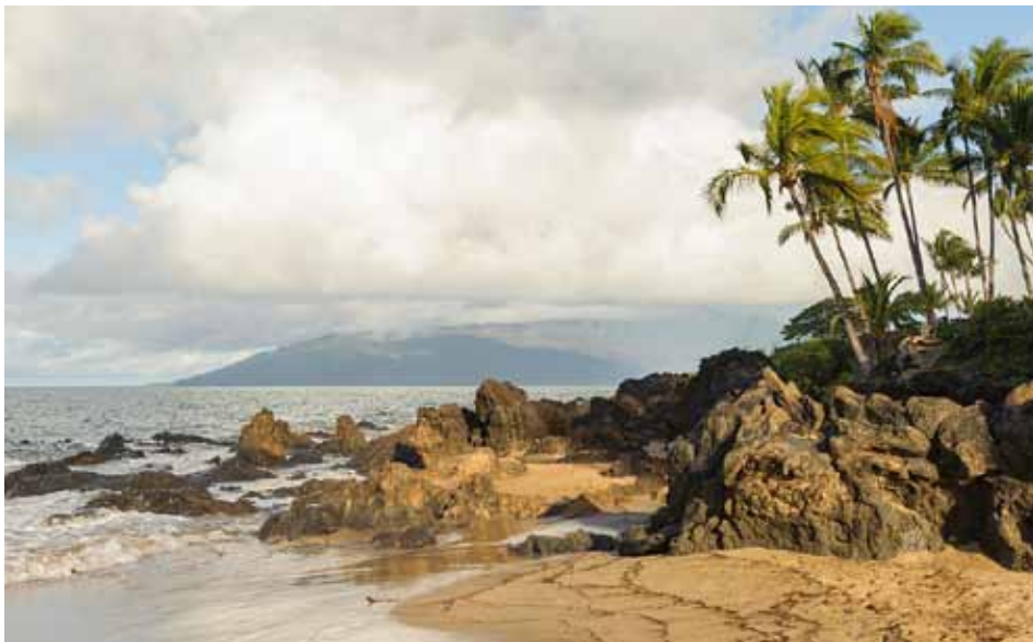
A beach on Maui