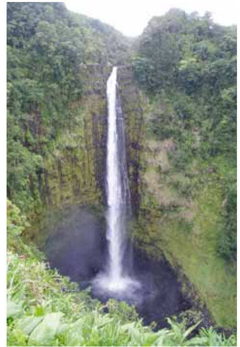
Akaka Falls near Hilo on the Big Island of Hawaii