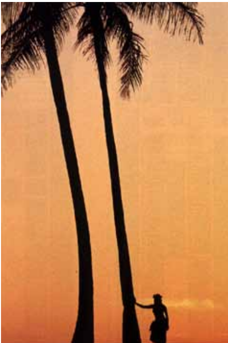
Hawaii, one of the most romantic places in the world

tains, cascading waterfalls and towering ocean cliffs. Optional tours include Fern Grotto and Waimea Canyon, the Grand Canyon of the Pacific.