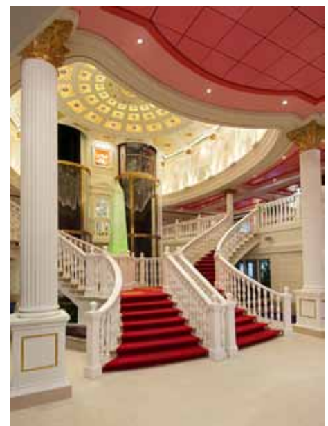
Capitol Atrium of Pride of America