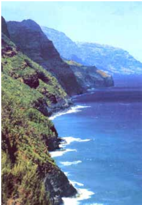
The rugged Na Pali Coast, see it best from the sea

Relax this morning with a swim in the warm ocean or a stroll along Waikiki Beach, the most famous beach in the world. After we check-out of our resort, board our chartered coach for a transfer to the pier to embark our floating resort, the Pride of America , the only ship that spends more than double the time in port than any other cruise! After lunch on board, spend the afternoon getting settled in and learning your way around the ship, your home for the next 7 days. All meals are included aboard the ship throughout the cruise! We sail at 7:00 P.M. but don't miss the beautiful sunset this evening. (B, L, D)