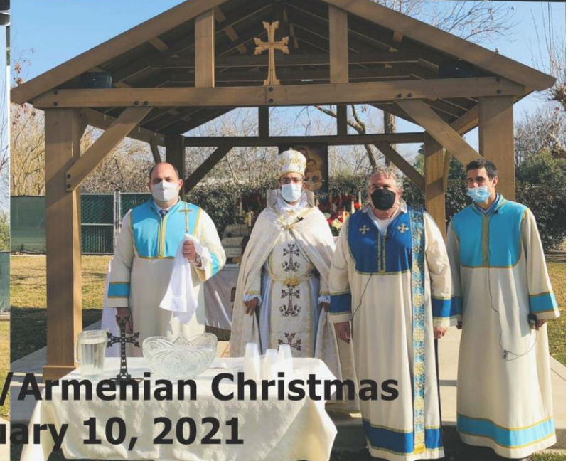
Theophany / Armenian Christmas January 10, 2021