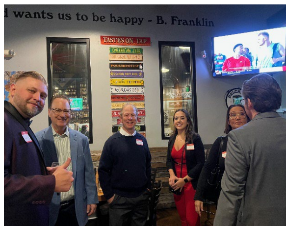
The Northern NV Holiday Mixer was held on Tuesday, December 3rd at Mellow Fellow with 30 people in attendance. We were able to donate over 40 toys to the Northern Nevada Children's Cancer Foundation.