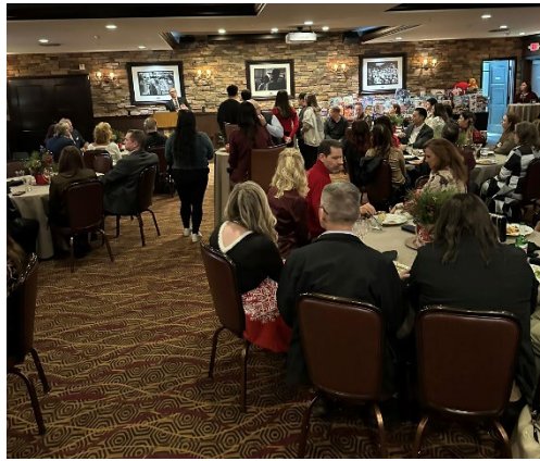
Pictured left attendees at the southern Nevada Holiday Mixer.

We celebrated the holidays at the annual Nevada Healthcare Forum Holiday Mixers. The Southern NV Holiday Mixer was held on Thursday, December 5th at Sierra Gold with over 100 people in attendance and over 300 toys were donated to the Nevada Childhood Cancer Foundation.