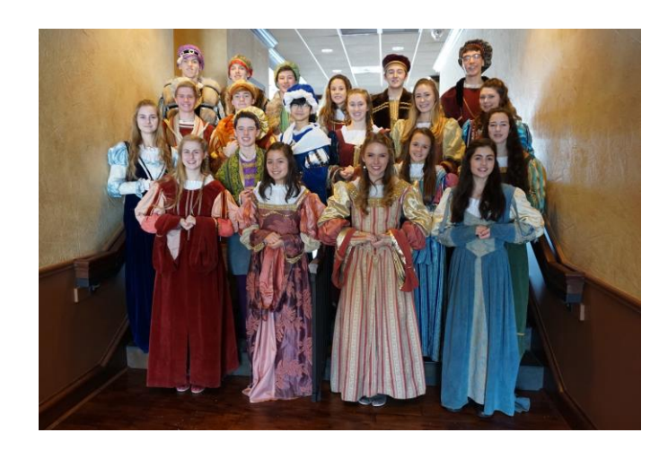
Kohler Madrigal Singers