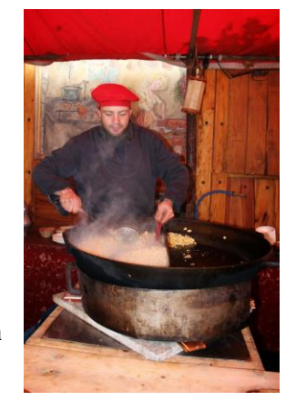
This chap is preparing the Kässpätzle I ordered for lunch. Kässpätzle = Swabian noodles and cheese

One thing I did for the first time this year is play Mäuseroulette . The woman in charge of the game was very enthusiastic and convinced me as I strolled by that I would love this game for only zwei Taler (medieval coins, Euro today)! I readily admit I enjoyed it, and I will play it again when I return. This is a picture of Karamelle the mouse (the caramel-colored blur) running into a house upon which my Edelstein is not. Yes, it is a real, live mouse! The lady standing next to me won, though.